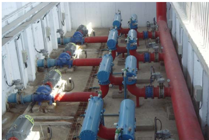
Figure 5 Filtration pumping station of the afterheat utilization project in Wukuang Medium-sized Plate Factory