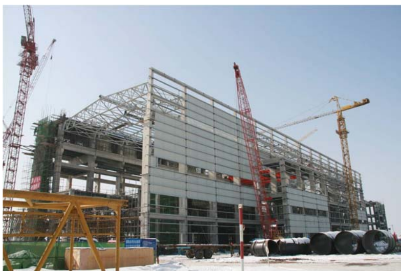
Figure 4 Power house of Yingkou City Proper Thermal Power under construction.

Funded by Huaneng Group, the City Proper Thermal Power Plant started to be constructed in July, 2008. According to the plan, two 200,000kW thermoelectric units and their affiliated heat networks will be constructed in the phase I project. Due to vigorous support from Yingkou Municipal Government, the first unit is estimated to be completed and put into operation by the end of 2009. It is estimated that the 17-month construction period will probably create the national shortest construction record in building large-scale thermoelectric units of over 300,000kW. Figure 4 shows the power house of Yingkou City Proper Thermal Power under construction.