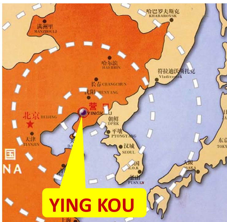
Figure 1 Yingkou's geographic location