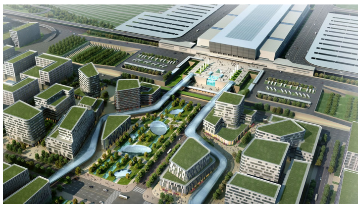
The Detailed Planning of Hongqiao CBD in Shanghai

An initial exploration of the low-carbon planning of the community scale is made in the practice of the low-carbon business district in the Detailed Planning of Hongqiao CBD in Shanghai. There, a pedestrian environment as well as energy-saving building groups are created through a spatial pattern of small housing blocks, high density and low height; long-distance trips are limited through combined distribution of functions; walking possibility is enhanced through a diversified public space; pedestrian transport and bicycle transport are encouraged.