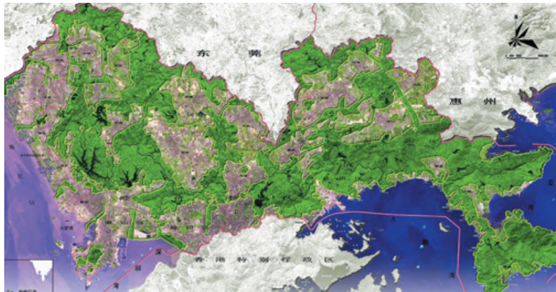
The basic ecological control line of Shenzhen

As another example, the basic ecological control line defined in Shenzhen is determined on the principle of equilibrium between carbon and oxygen. It is so planned that after nearly half of the city area is defined as the scope of the basic ecological control line, illegal construction actions that harm the ecological control line will be under stringent control to guarantee the effect of natural carbon fixation, thus laying a good foundation for attaining the low-carbon target there.