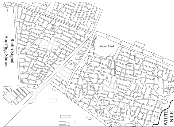
Figure 3: layout of Al-shigla Case study.

Soon after the preparation of the Khartoum new master plan of 1990, several re-planning projects has been initiated at the capital region mainly under the supervision of the Village planning committee, yet its important to note that the result of many of these projects besides residents getting legal land ownership document “ is neatly demarcated streets and nothing more ” viii Al-shigla which is geographically composed of three physical segment “ east, wasat (Central) and west” is one of these areas that have been re-planned accordingly.