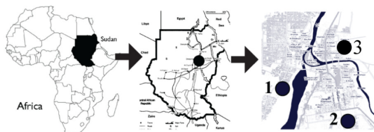
Figure 1: Location of the country, City of Khartoum and the Case-studies Areas.

The purpose of this paper is to explore the process of community participation in Sudan in legislative planning (planning acts and bylaws) and community level plans based on several projects studied to determine to what extend the concept of community participation has been used or abused in Sudanese planning practice. The methodology used in this paper is based on literature review backed-up with a fieldwork and semi-structured interviews with community leaders, local councillors and members of legislative council, the subject of this paper is the capital region of Sudan (Khartoum), three case studies that represents the local level at the city of Khartoum has been chosen for the study (Fig-01).