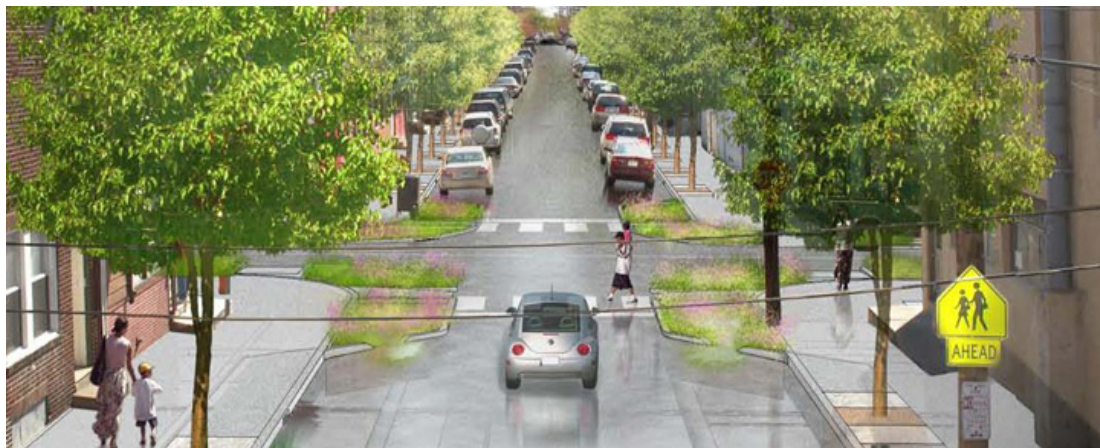
“Green Street”

While envisioning Philadelphia, city father William Penn said, “Let us build a fair city between two noble rivers; let there be five noble squares, let each house have a fine garden, and let us reserve territories for farming.” As McHarg (1998) retorted, Penn’s notion came before we discovered the efficient manner in which rivers carried sewage, or that city farmland was best-suited for buildings. The Philadelphia at the beginning of this century and the Philadelphia of the 17 th century bear little resemblance. This is not the “garden city” that our founder envisioned.