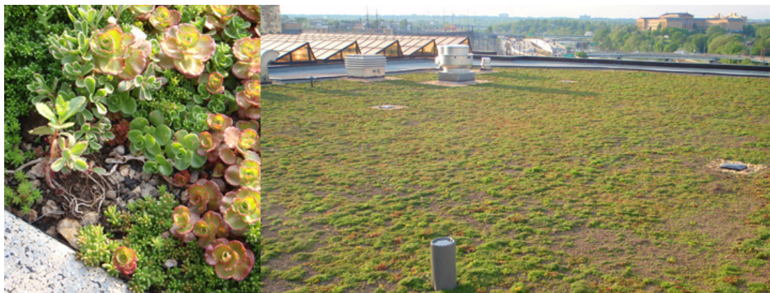
"Green Roof"

Green roofs are another major tool used in reducing stormwater runoff volume. Green roofs consist of multiple layers of material that insulate and waterproof the roof, while also allowing drainage. Different types of vegetation are planted on the top layer. Green roofs are separated into two classes, intensive and extensive.