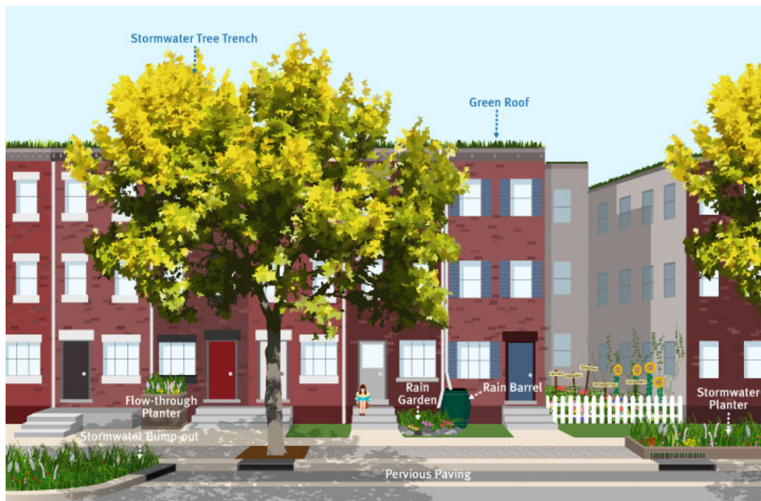
"Stormwater Management Tools"

Another important element of the stormwater regulations is "sequencing to minimize stormwater impacts." In order to encourage green infrastructure, the developer is required to find practicable low impact development (LID) alternatives to surface discharge of stormwater (PWD 2006). The site developer must first prepare an "existing resource and site analysis" map and worksheet, which will display sensitive environmental areas and natural resources on site. The developer must then establish a natural buffer by preserving native species of plants and trees adjacent to any surface water body. Next the developer must prepare a draft of the project layout, showing avoidance of the sensitive areas identified in the analysis. The developer must then evaluate nonstructural stormwater management alternatives. During construction, the operator of the project must minimize earth disturbance, while also reducing impervious surfaces and directly connected impervious areas within the limits of said earth disturbance. Finally, the developer is responsible for the design of stormwater detention and retention structures. The developer is also required to adjust any site designs as necessary, in order to meet the requirements of the current regulations. Post-construction implementation of LID practices and stormwater easements will prepare the site for its intended function. These sustainable practices will pay dividends when stormwater impact fees are assessed.