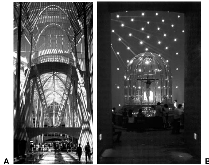
Figure 6. The modern Cathedral?

become spectacular sites with a very profane outlook which draws them closer to the modern Man.