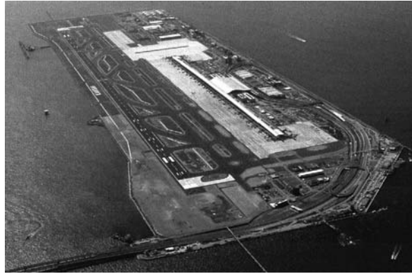
Figure 1. Kansai International Airport, Osaka (arch. R. Piano, 1994) - built on the artificial island this airport complex has become not just a new city gateway, but an important symbol of technological progress. (Pearman, Hugh (2002) Contemporary World Architecture , London: Phaidon Press, pp. 356)

At the same time, the railway and subway terminals, although mostly important for regional connectivity, have a twofold role. They could be interpreted as reinvented urban landmarks (Rotterdam-Blaak, Lyon-Satolas, Toyama-Takaoka) or they could be used as symbols of new urban regeneration (London, Bilbao, Seville, Lisbon etc.).