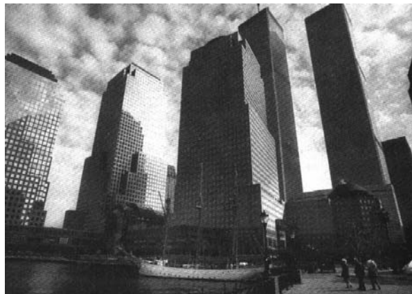
Figure 2. World Financial Center, New York (arch. C. Pelli, 1981) - the role model for the business areas of global nodes (Sudjic, Deyan (1993) The 100 Mile City , San Diego, New York, London: Harcourt Brace & Company, pp. 40)

The connectors of capital, with their similar skylines, emphasize the global character of financial and information flows integrated into large business districts. However, even these oases of concentrated multinational corporations are based upon powerful urban infrastructure that should provide excellent physical and electronic accessibility, as a guaranty of global sustainability and progress. The monumental geometry made of steel and glass should symbolize the global potential of the urban node(s), but also represents the power of multinational or local corporations, state aspirations and, above all, the global 'landmark' which should channel international financial flows.