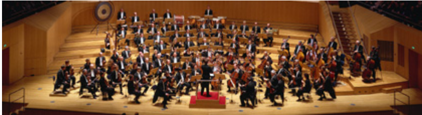
The Bamberg Symphonic Orchestra

The Town of Bamberg for example has a symphonic orchestra, a theatre, a university, an international artists residence and many more cultural highlights on one side. Many contemporary authors, painters, craftsmen are living here.