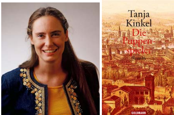
The author Tanja Kinkel, living and writing in Bamberg