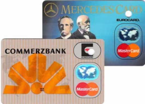
chip cards, produced in Bamberg