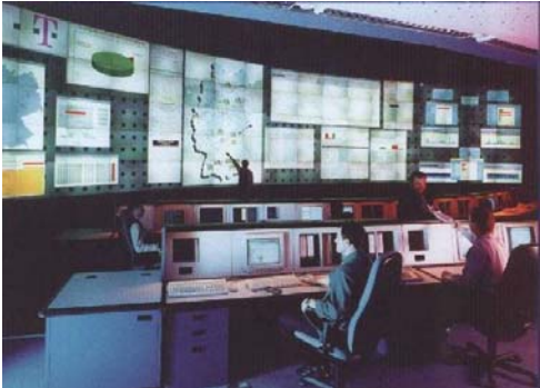
Telecommunication Net Management Center in Bamberg