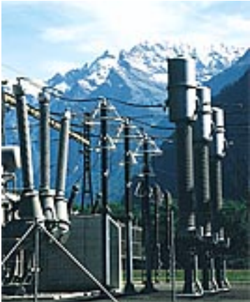
gas-insulated transformers, invented and produced in Bamberg