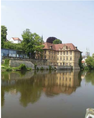
International Artists Home "Villa Concordia"