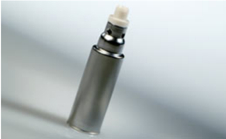
injection-molded parts, invented and produced in Bamberg