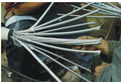
rapid contact technology, invented and produced in Bamberg