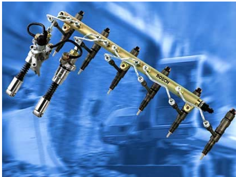
diesel fuel injection system, invented and produced in Bamberg

In the town of Bamberg the creative heads of electronic and mechanic industry are inventing the world-wide-high-tech technologies.