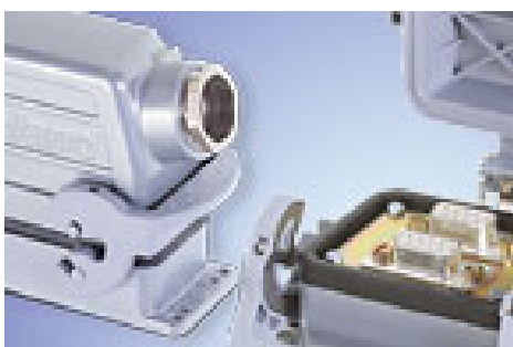
Industrial multipole connectors, invented and produced in Bamberg