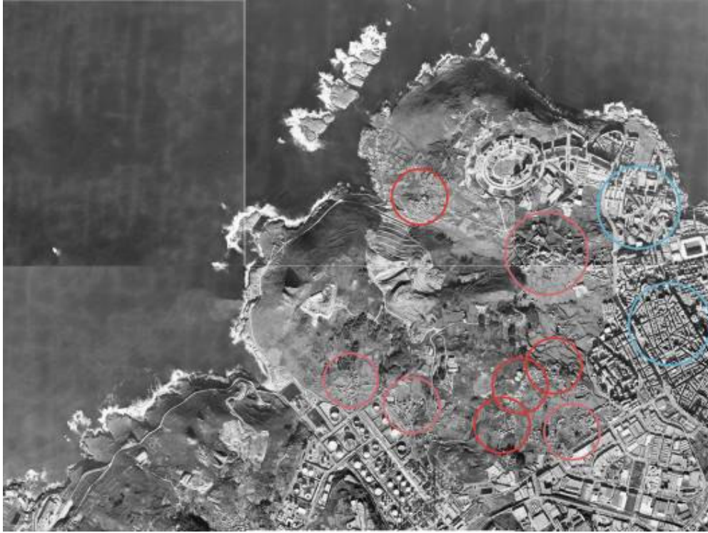
Figure 2: Vulnerable urban areas located in the sector of Portiño. Own production