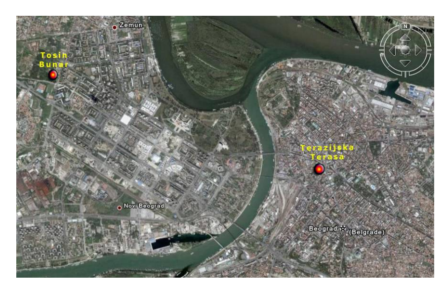
Figure 2: Position of the two exemplary locations within the city of Belgrade

As an exemplary two locations in Belgrade are chosen - in the centre of the city and on a periphery. For both locations recently there were urban-architectural competitions. Both of them, on one way or another, are of interest for the further development of the city of Belgrade.