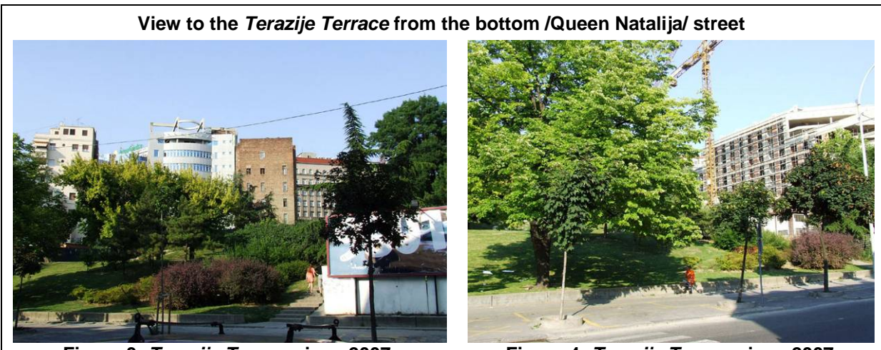
Figure 3: Terazije Terrace, june 2007.

Investors for the competition (and of future realization) were the city governance and the private company which constructs the business building on the side. Goal of the competition were to create attractive design for this public space, especially because the construction work on the building is in its final phase and it is important to configure connections of the building with the space of Terazije Terrace, as physical – entrance, communications... as aesthetic.