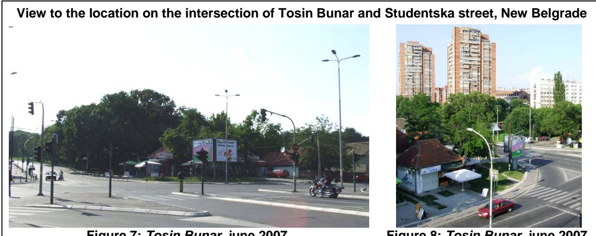
Figure 7: Tosin Bunar, june 2007.

Initiator (and the investor) of the competition (and of further realization) was private company. Goal of the competition was to gain solutions/suggestions for spatial organization of the "Commercial and Trade Center" - complex with the business and recreational space with approximately 10-12000m<sup>2</sup> altogether, with the specialized Hypermarket of a 4000m<sup>2</sup> as the main element of a program.