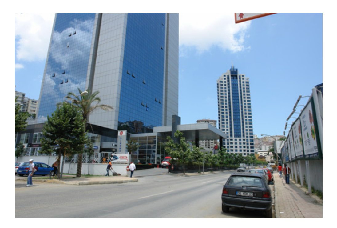
Fig. 6 Polat Tower, Fulya

Residences in Istanbul are mostly located at the heart of the service sector axis such as the ones between Buyukdere and Maslak and between Sisli and Mecidiyekoy. These residences are mixed used complexes which include a shopping center, offices, sports facilities, movie theathers and restaurants. Although they are rather large scale settlements, housing units are only a part of the complex.