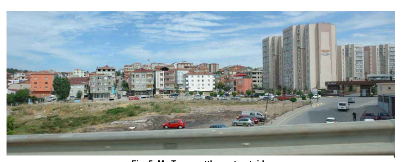
Fig. 5 My Town settlement-outside