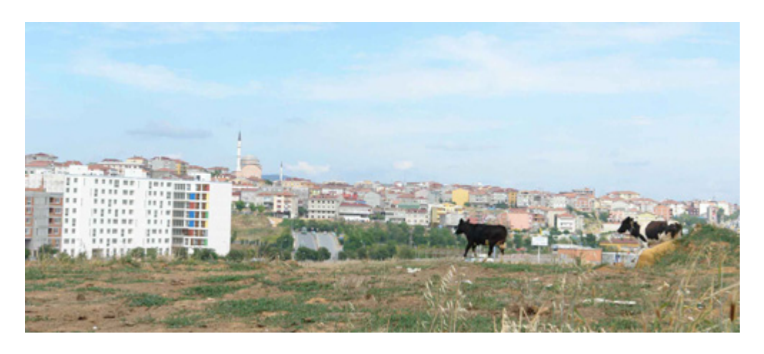
Fig. 3 Evidea settlement