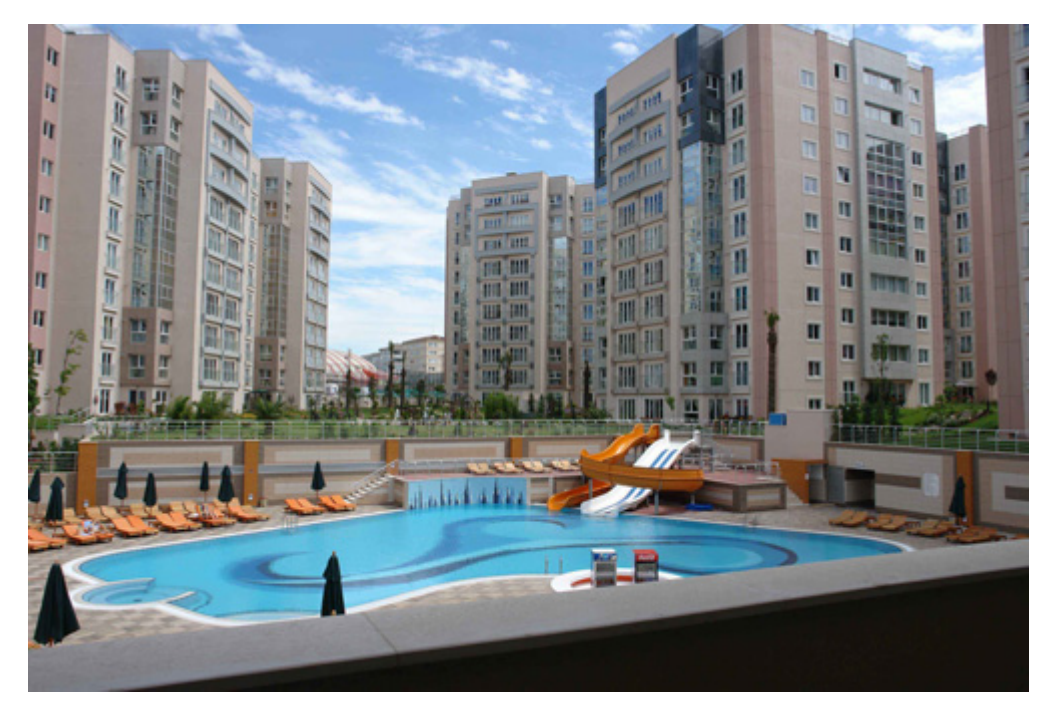
Fig. 4 My Town settlement-inside

The most significant aspect of the gated communities is the privatization of the public spaces. The public spaces contain open and closed sports facilities, restaurant, social club, recreation areas, education and shopping facilities which are open only to residents' of the gated community. Since almost all the urban needs are satisfied within these settlements; but evidently, the residents' interaction with the urban life and the 'other' people gradually disappear ( Fig. 4, Fig. 5 ).