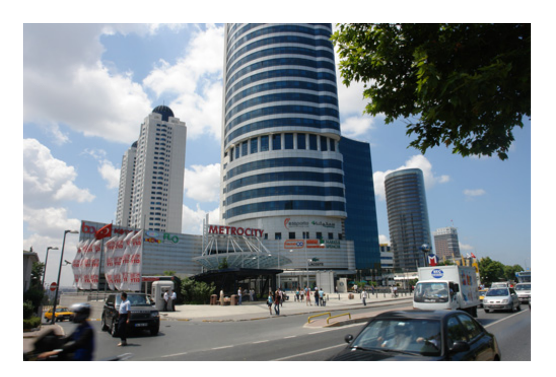
Fig. 7 Metrocity, Levent

The demand for such residences usually occur due to the use of technology and their valuable location. Despite the fact that these residences are presented as "smart buildings" indeed, with the level of technology does not exceed the use of electronic lock systems, security cameras and etc. (Fig.8)