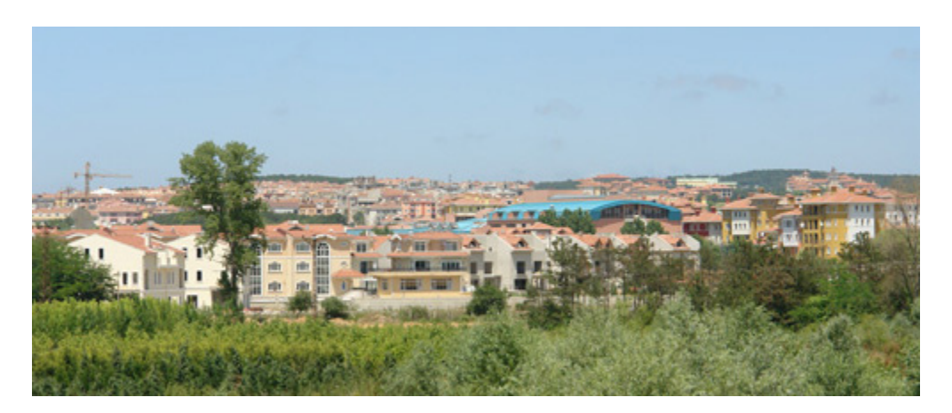
Fig. 9 Gated communities in Göktürk

There is an ongoing discussion whether the gated communities at the periphery are the suburbs of the city or not. Almost all of them are built within the municipality regions rather that the rural areas ( Fig. 9 ). Such examples to these kinds of gated communities are: My Country, My Town, My City, Yeşilvadi Evleri, Sinpaş Aqua City, Evidea, Grenium Evleri, Aqua Manor at Umraniye municipality Cekmekoy county, Optimum Konutları, Yankı Evler, Yamaç Evler at Umraniye municipality Omerli county; Istanbul-Zen, Istanbul-Bis, Istanbul-Istanbul, Kemer Hill, Doğa Meşe Park Evleri, Selenium Country at Kemerburgaz municipality Gokturk county. It is not a coincidence that these gated communities are not built within the limits of the metropolitan municipalities. Therefore, they do not necessarily need to oblige with the zoning codes of the metropolitan municipality. At the peripheries these settlements can develop their own zoning plans, which explains why most of the settlements are constructed in Istanbul's water and forest basins. Thus, despite the city planners recommendations on the city's development toward east and west direction, the city continue growing on the north and south directions.