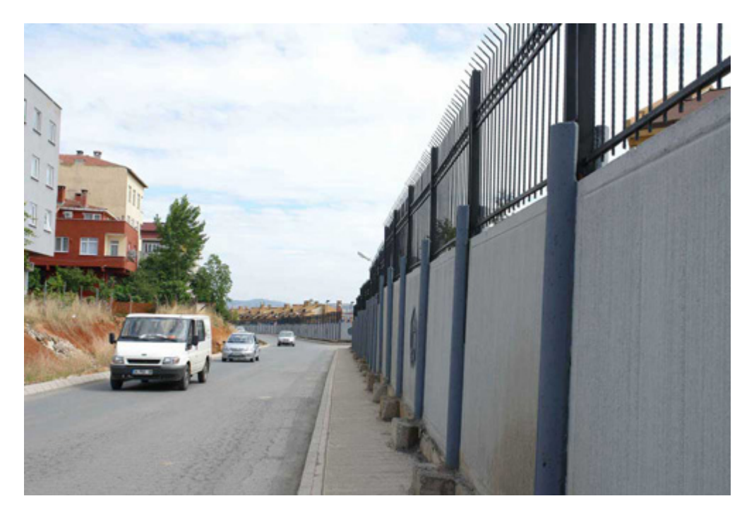
Fig. 2 Aqua Manor settlement

The changing demand of the new mid-class was satisfied with the concept of "luxury housing" followed by the increase in its supply . These housing settlements allowed people to spatially differentiate themselves from the others whom they did perceive belonging to their stratum. This is why these "luxury housing settlements" are the gated communities for the new mid class. High walls which surround the settlements for kilometers, private security staff and the grand gates which are monitored through cameras define the clear boundaries. To be inside or outside of these gated communities defines the two poles. The world in the inside of these settlements is "neat and sterile". However, right outside, usually adjacent to these settlements, low-income level people live in houses which have only four walls, not painted, far away from minimum standards and usually have neither road nor sidewalks. ( Fig. 2, Fig. 3 )These housing settlements have similar properties in other central metropolises.