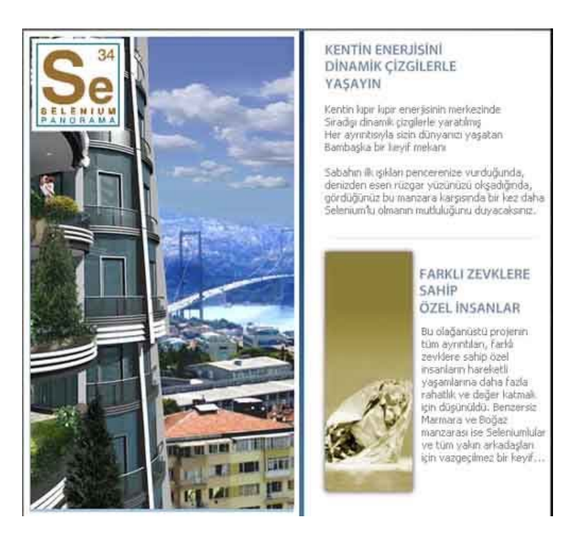
Fig. 8 Advertisement for the Selenium Residence

The demand for such residences usually occur due to the use of technology and their valuable location. Despite the fact that these residences are presented as "smart buildings" indeed, with the level of technology does not exceed the use of electronic lock systems, security cameras and etc. (Fig.8)