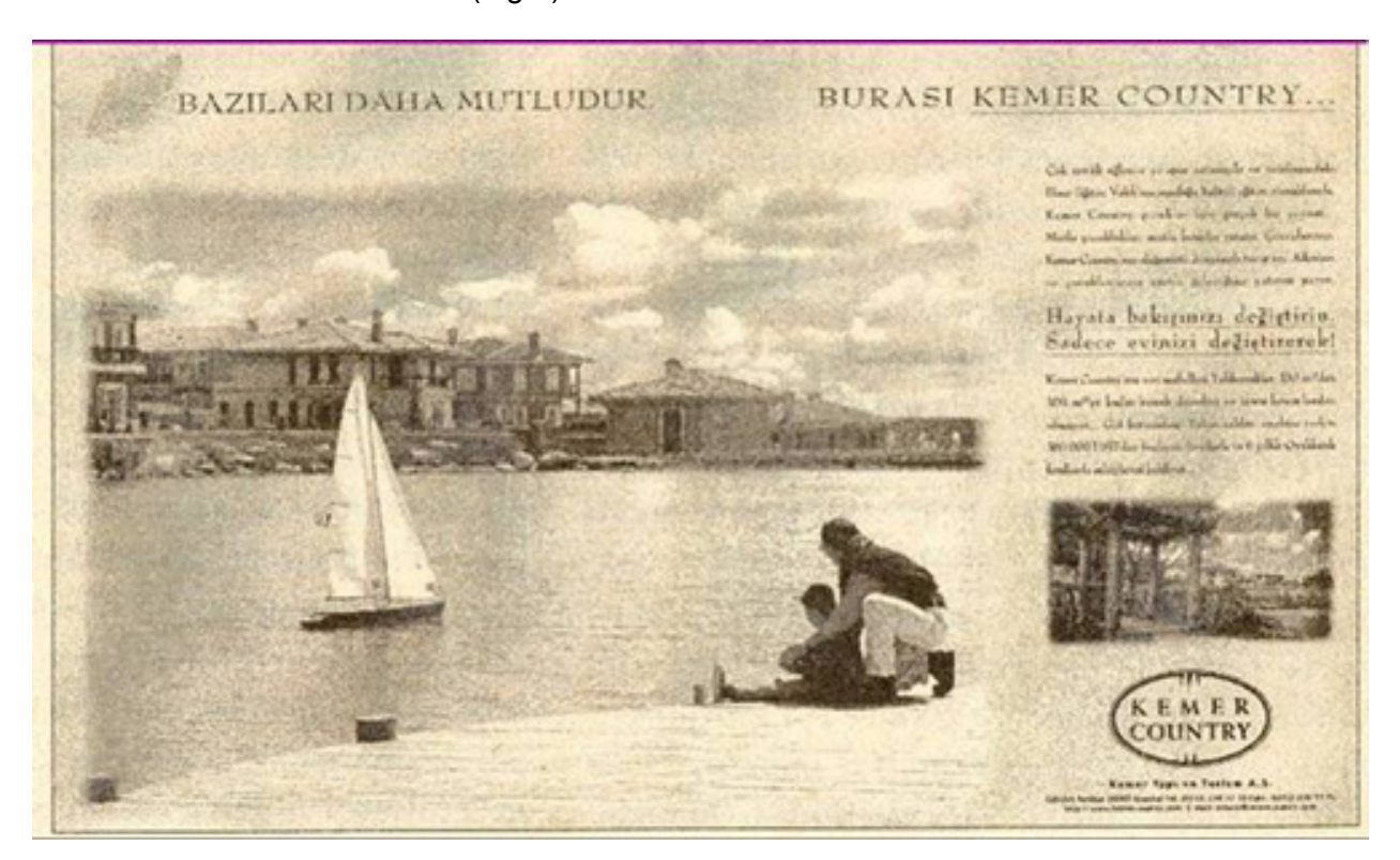
Fig. 1 Advertisement for the Kemer Country settlement, 1995.

Through its typological, social and interior properties housing became the material reflecting wealth of the class. This reflection is so exaggerated that the housing of the "rich and famous" became the focus of the media (Fig.1).