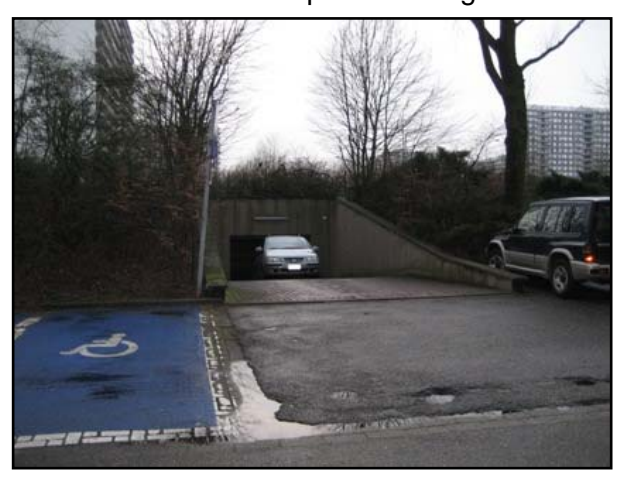
Figure 3: the entrance of one of the vast underground parkings at Europark

In one of these exercises people walked with closed eyes through the pedestrian tunnel below the river Scheldt. As a special structure the tunnel makes specific trajectories possible. It connects the two important living domains of inhabitants, the neighbourhood and the city