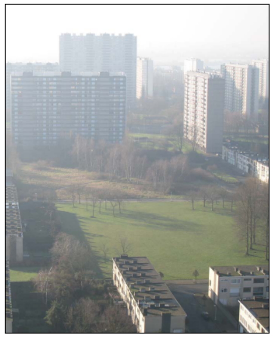
Figure 2: The neighbourhood Europark at Linkeroever

schools. Al other infrastructure is cancelled and by the time it has to be built, there's no money anymore. Instead of city of 100.000 residents, Antwerp and Imalso fabricated a hybrid district where 15.000 people live (5.000 in Europark, for the majority social housing) and almost no urban supplies. In the seventies, Linkeroever is still famous for its St Anneke beach in the north (as it is still today) and the good restaurants there but the brand new Europark becomes a Fremdkörper indeed. No one goes there except the ones who live there and even they move after some years. From the eighties on, immigrant families and refugees are placed in the blocks. The distinction of the three parts gets even stricter, both physically with (the buildings and open spaces) and socio-demographically.