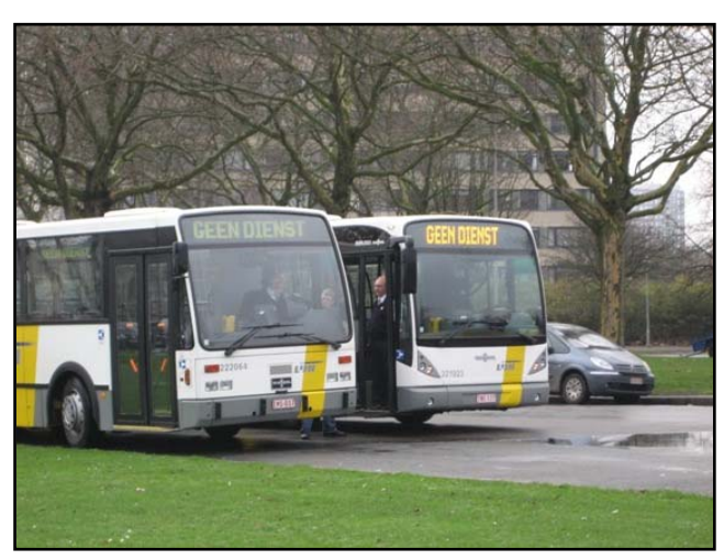
Figure 4: bus drivers at Linkeroever, waiting for the next ride

Linkeroever is specialized in giving a place to the 'informal', but in a specific, almost un-urban way. Linkeroever is the final stop of a lot of regional busses. Bus drivers have their break there. Regularly you see busses parking one beside the other and bus drivers talking with