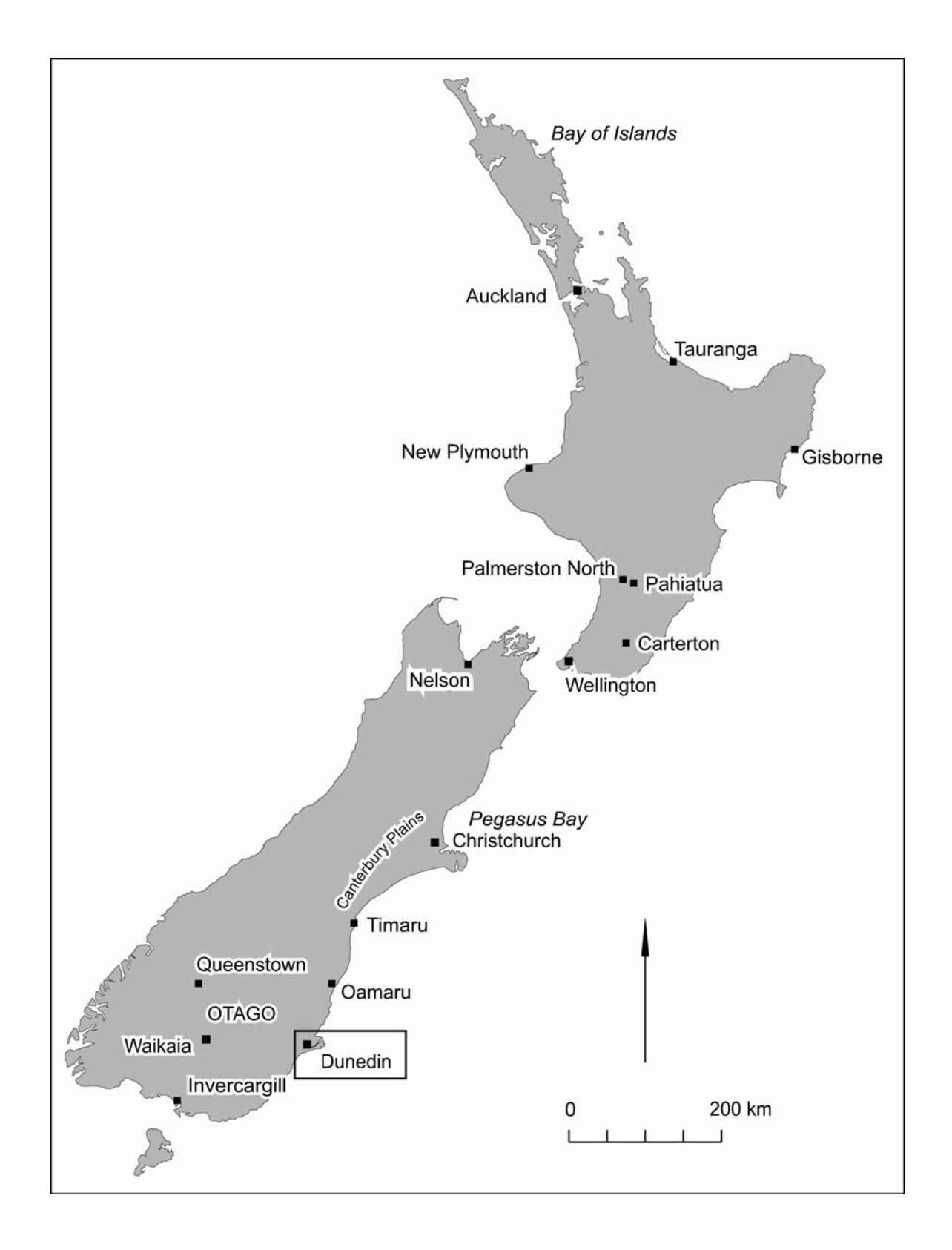
Figure 1: Location of Dunedin in New Zealand