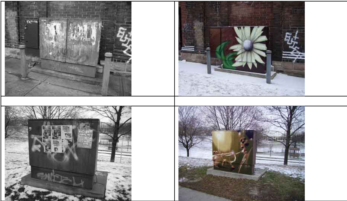
Before and After Images, Bell Canada OPI Boxes, Ward 19, Toronto, Ontario (City of Toronto)

This project offers a number of insights. First, there is the question as to whether the boxes should be allowed to exist at all in the public realm. No answer to this question appears imminent. Is the solution proposed the most appropriate? Should money be put into maintenance or should more emphasis be paid to by-law enforcement. Would new by-laws prohibiting posterage, with stiff fines, be appropriate as a deterrent?