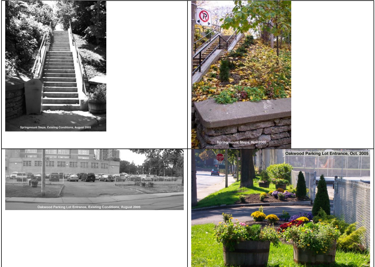
Regal Heights Stair (Above), Plantings (Below), Before and After (City of Toronto)