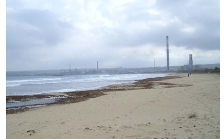
Fig. 4 – Separation between ordinary and sectorial planning: high value environmental areas within the great industrial pole of Priolo (Syracuse)

In this perspective we can assert that a large scale planning process could be for Sicily a strategic opportunity to execute a radical change: the reorganization of regional planning tools set based on the principle of integration, the reform of institutional roles and tasks towards the co-planning approach and the reconstruction of social cohesion through the rediscover of shared values and interests. Indeed land could become one collective value and be protected from future consumption too.