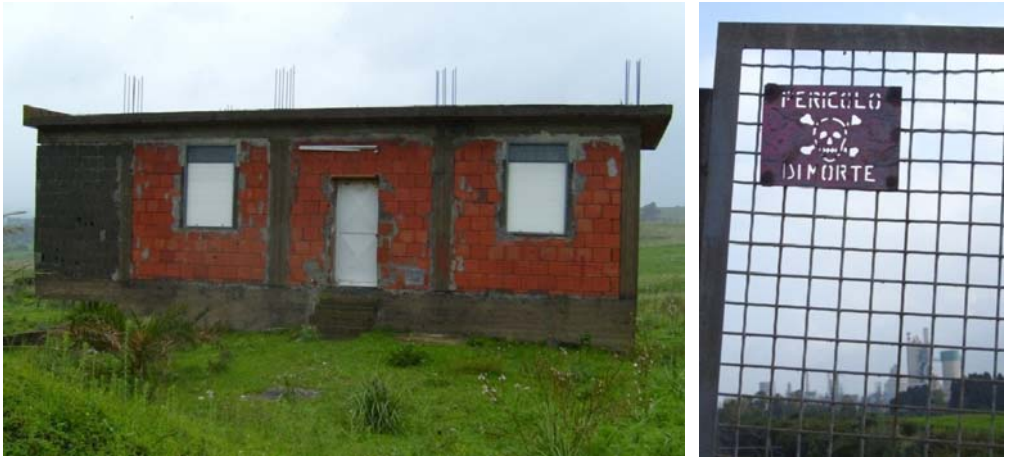
Fig. 5 – "Developments of private interest": a typical illegal house