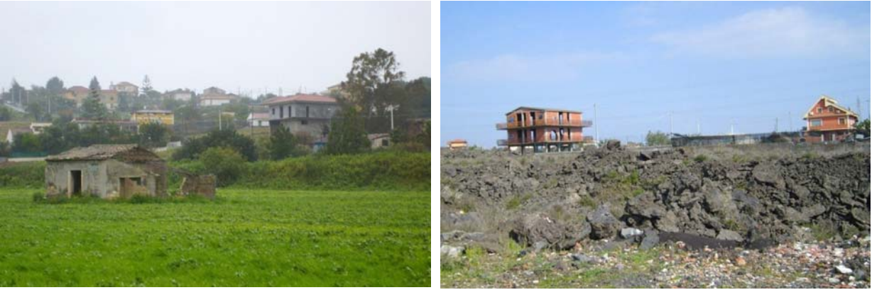
Fig. 1 – Coastal spontaneous settlements in the area south of the municipal boundaries of Catania

However, in all these cases neither the legislative system and planning tools nor regional government have demonstrated any interest and sensibility for the land waste question, in addiction to the inability to implement concrete actions to limit or end it (Nigrelli, 2005).