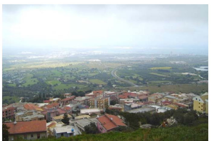
Fig. 3 – Syracuse coasts: the coexistence of residential settlements, industrial poles and restricted areas

Therefore it emerges an extremely critical regional legislation characterized by discontinuity and incoherence and excessively vulnerable to the appeal of private funds. Furthermore higher planning tools that would be reference points, instead are completely absent: so the Sicilian context can be defined as a "picture without frame".