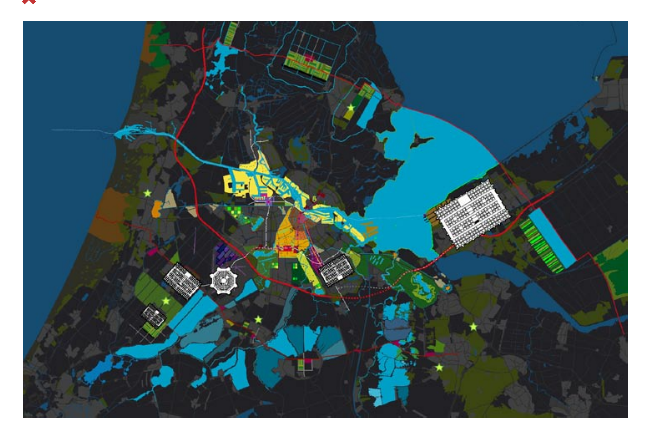
15. Establishing Cities. The Netherlands has a tradition extending from the 16th to the 20th centuries of establishing towns and cities from scratch in polders reclaimed from the sea. This is how we should build in the future, too: no off-the-peg Vinex expansion districts or American suburbs, but a continuation of that Dutch building tradition.