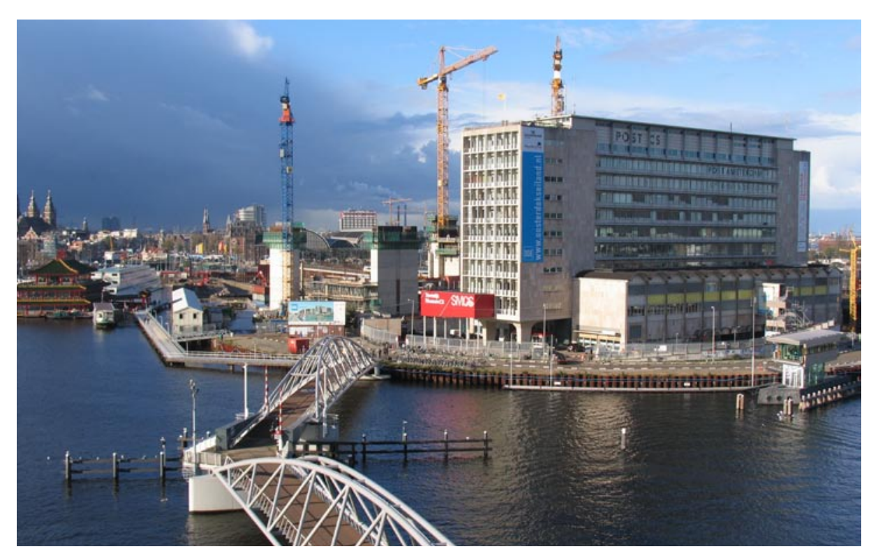
Developments along the IJ waterway

In pursuance of this masterplan, new urban environments were added to Amsterdam, including the banks of the IJmeer lake and the developments along the Schiphol-Amsterdam-Almere axis. Efforts were also directed at the regeneration of post-war residential districts. Two years ago there was an assumption that the city would be 'complete' once these projects were finished, but regional developments and safeguarding Amsterdam's global competitive position require a new way of thinking about the city's position. This new way of thinking ushers in the paradigm shift – from constructing as many residential units as possible in a compact city to the development of an international metropolis. That does not mean complete abandonment of the compact city concept, but quite the contrary: compact development is still necessary in order to build towards the metropolis. Space in the city remains limited, after all.