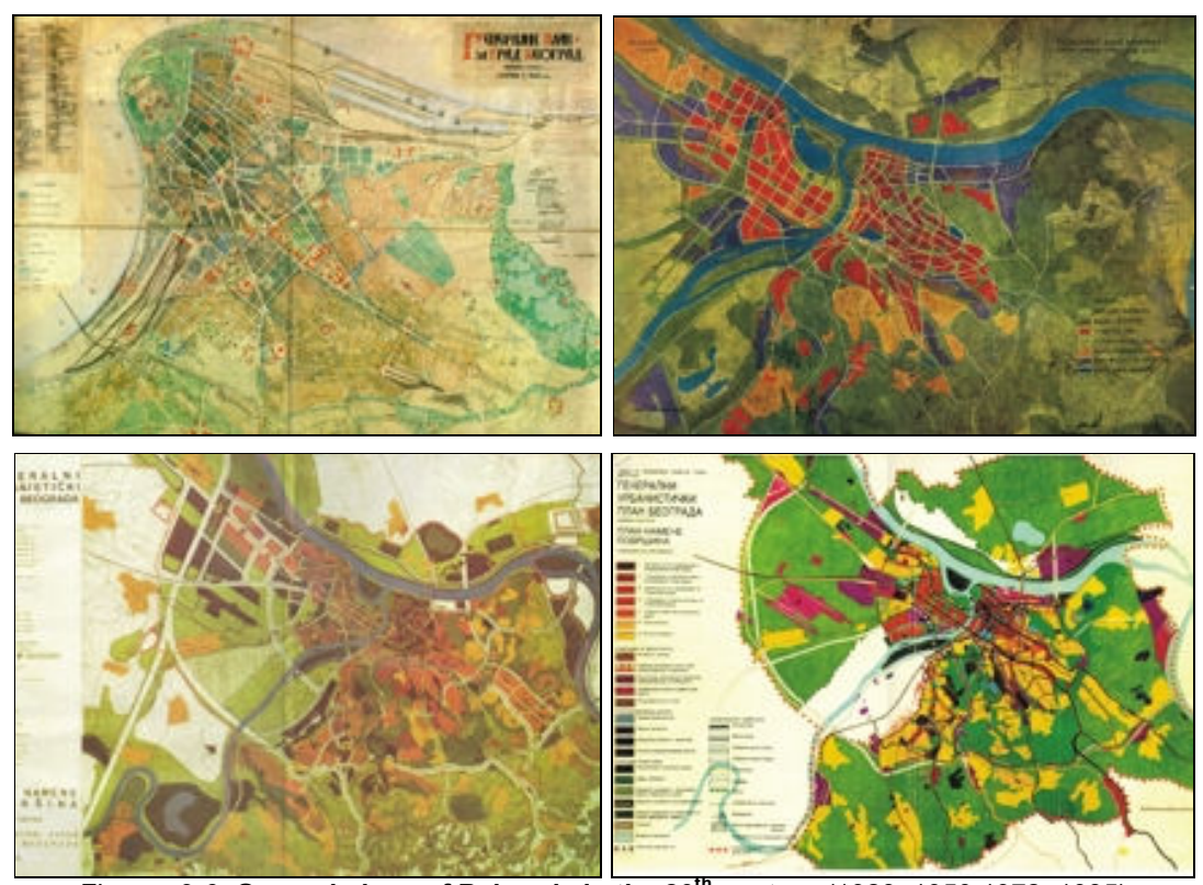
Figures 3-6: General plans of Belgrade in the 20<sup>th</sup> century (1923, 1950,1972, 1985)

In the last century , Belgrade had four general plans , which defined the concept for its spatial organization and development. These were: