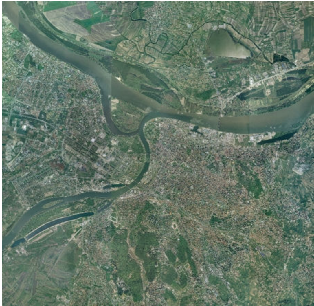
Figure 1: Aerophoto view of Belgrade , 2003

Geographical location of Belgrade is unique in Europe. It has been built at the borderline of two large geographical areas: the bottom and perimeter of Panonia lowlands, and the north outlines of the mountainous Balkan Peninsula. The location of Belgrade, however, has not always had the same significance in various historical periods.