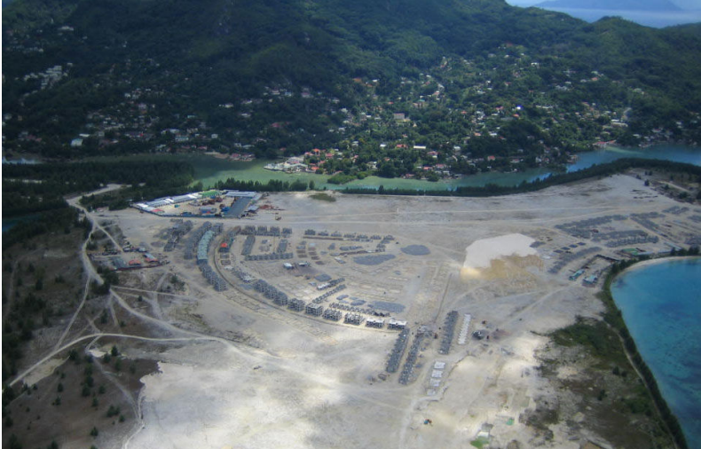
Figure 4- Ile Perseverance under construction

Ile Perseverance Housing Project is the working name for the development. It is at the moment under construction (Fig 4) and is expected to be fully operational by 2012. There are five contractors engaged in its realization two of which are Chinese construction companies, China State Quindao and China Shenyang.