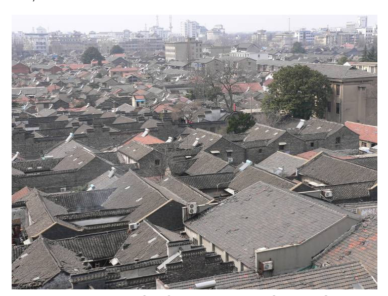
Fig.1 Historical Areas in the Old City, Yangzhou.

over the age of 60, and 21% residents over 70. <sup>2</sup>