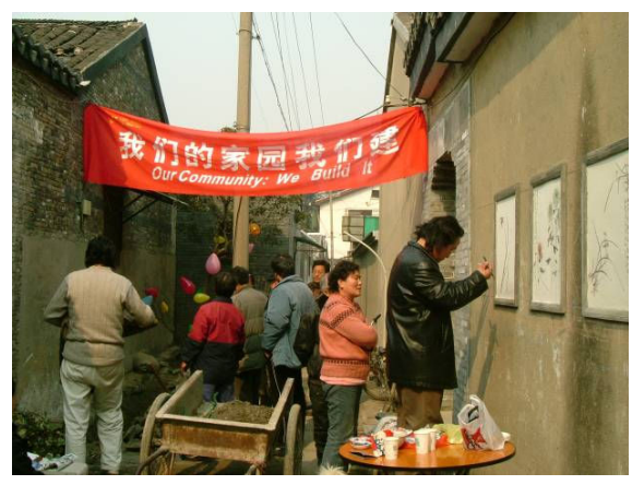
Fig. 5 A Mini CAP for Open Space Improvement.