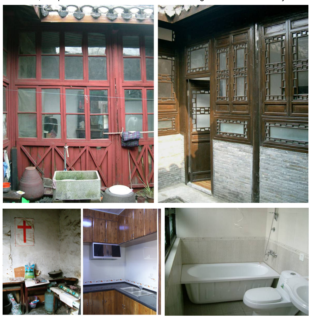
Fig.6 A Renovated House with Modern Kitchen and Toilet in the Pilot Area (Before and After Renovation). The result: Young members of the family will come back to live together with their parents.

In Yangzhou, the first integrated CAP approach as a participatory model that was supported by the government and participated by the residents, rather than fully funded by the government, has been developed for the rehabilitation of the traditional neighborhoods. The model is now being further detailed, computerized and will be disseminated throughout the entire Old City.