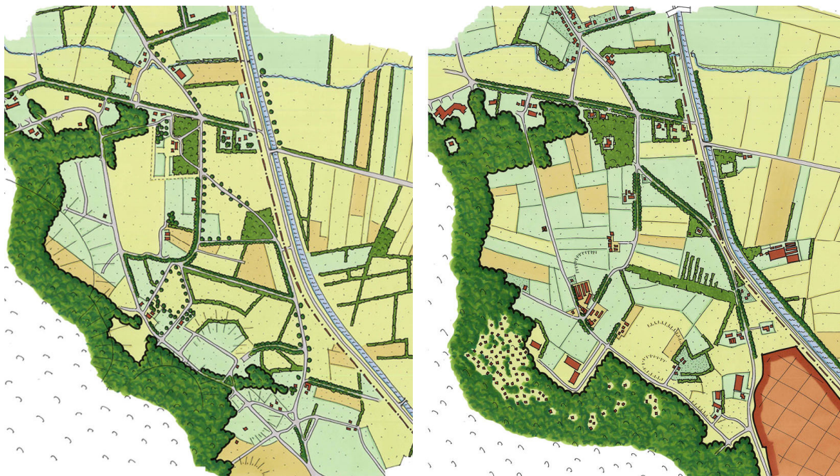
Figure 1. Development of the agricultural landscape at one of the case study projects between 1907 (right) and 2006 (left). Paths, hedges and trees have disappeared and urban fabric (bottom right) appeared.

The Dutch government, inspired to a degree by the political and societal movements of Neoliberalism and New Public Management - which still influence planning policies today – realised that it was in a good position to upgrade the spatial quality of the countryside without having to pay for it. From 1993 onwards a policy was developed which allowed landowners in rural areas to build a large house (red) if they simultaneously developed 5 or 10 hectares of their land for nature and recreational purposes (green). This policy became known as 'red for green' in the mid 1990's and can be seen as a steering concept of the Dutch government at that time. This 'red for green' policy and its offshoots, however, have not proven to be a solution for the - present - problems in the countryside when it comes to matters such as the demand for affordable housing, ecology, liveability, landscape quality and recreation. But the basic idea of housing paying for nature and landscape development has still continued to evolve regardless of legislative constraints. Now, more than 15 years since the first policy, the Dutch are on the brink of a breakthrough in small-scale urbanisation projects which have substantial benefits for the countryside while offering solutions for more efficient agriculture at the same time. As we well know, the demand for agricultural products is increasing all over the world.