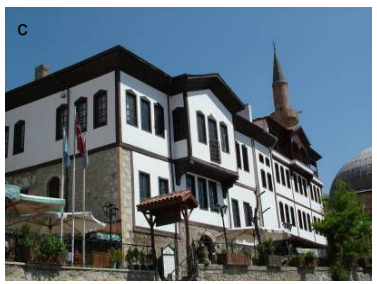
Figure 3. Tasmektep: a_in the 1930s, b_in the 1990s, c_in 2005