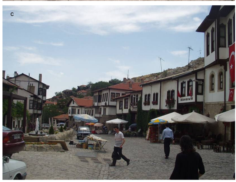
Figure 2. Alaaddin Street: a_before 2000, b_in 2000, c_in 2008