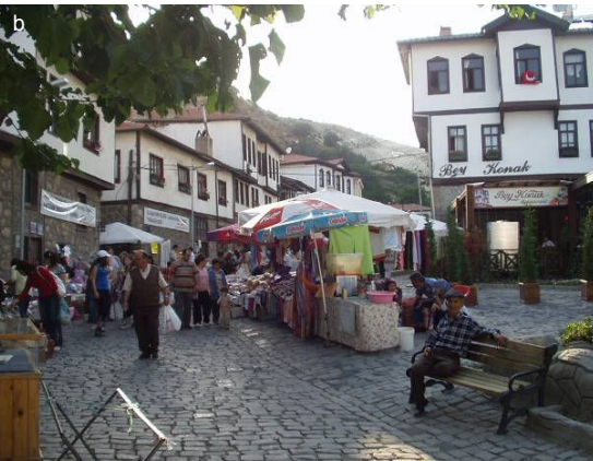
Figure 5. Alaaddin Street and Working Women

Project has also had a major impact on property values. Average cost of a traditional mansion in Alaaddin Street has reached to 350.000 YTL from 10.000 YTL in five years. It is stated by the interviewees that the community regrets selling their old properties to move to new settlement areas.