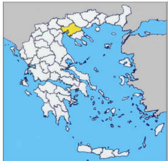
The location of the Prefecture of Thessaloniki in Greece

The negative effects usually outweigh the positive payoffs when the development of holiday homes takes place in defiance of the law. This fact becomes particularly evident in the case of Asprovalta, which is situated in the eastern part of the prefecture of Thessaloniki.