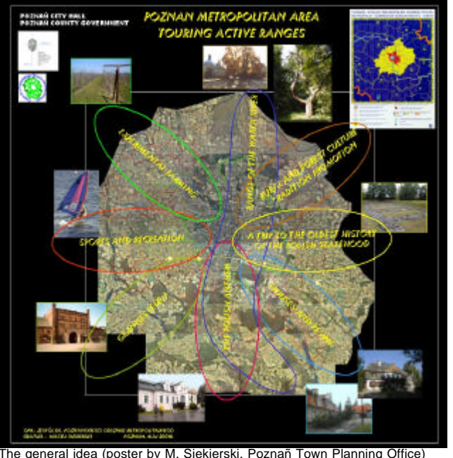
The general idea (poster by M. Siekierski, Poznan Town Planning Onice)

Below: an example of attractive surroundings and programmes related to manor house; an example of a neglected place where there is a need to improve the landscape and to implement activity programmes (the range "Houses and People", among other sites - the site of birth of Pawe<sup>3</sup> Edmund Strzelecki - Polish geographer, explorer and conqueror, discoverer of Koceciuszko Mountain in Australia, 15.02.1840; author of the range: Andrzej Billert, Town Planning Office, Poznañ).