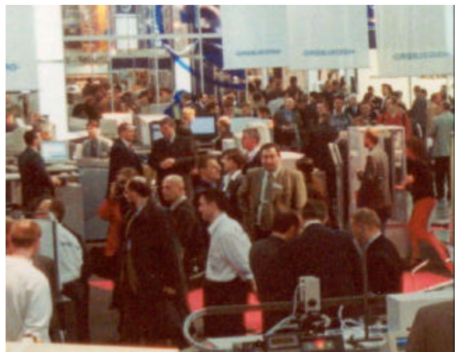
Poznañ International Fair.

The PIF, backed by 80 years of tradition and experience, owns and manages over 150,000 sqm of exhibition space. Even the oldest exhibition hall, erected back in 1911, after renovation features a combination of modern architecture with some elements used in its historical construction - identical with those of the Eiffel Tower. ( City of Poznañ Info CD , Poznañ City Hall).