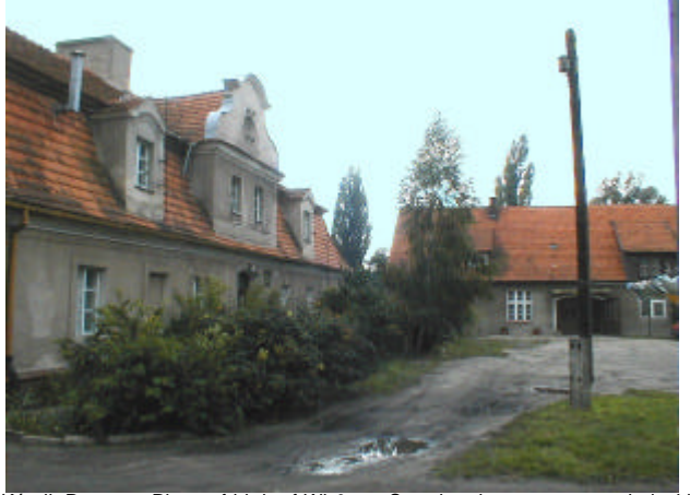
Kórnik Prowent. Place of birth of Wis³awa Szymborska, a poet awarded with Nobel Prize in Literature

The project corresponds to the interdepartmental educational programme of protection of historical landscape and proper formation of natural and cultural Poland, called "Conscious Formation of Landscape and Protection of Historical Landscape", implemented pursuant to the Ruling of the Prime Minister no 41 of 27 July 1999.