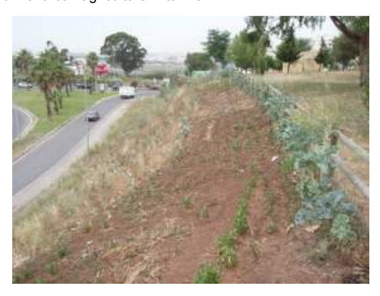
Urban agriculture in marginal areas of roads, Amadora

Today, with most shantytowns already transformed in planned urban areas, is the work of the immigrants from former Portuguese speaking-countries in marginal areas (roadsides, as the most notorious) that constitutes for the average citizen eyes, the biggest expression of informal urban agriculture in towns.