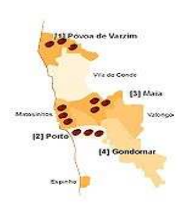
Localization and number of the allotments in the "Horta à Porta" program , LIPOR (in http://www.hortadaformiga.com/conteudos.cfm?ss=7)

One of the most famous, widespread and well implemented urban agriculture programs is the one conducted by LIPOR (the intermunicipal agency for solid waste in the Porto's area); the "Horta à Porta" (Kitchen-garden at the door) program began in 2003, has already 12 allotment areas in function, with a global area of 2,5 ha; in each allotment every user takes care of 25 m2 in organic ways of production.