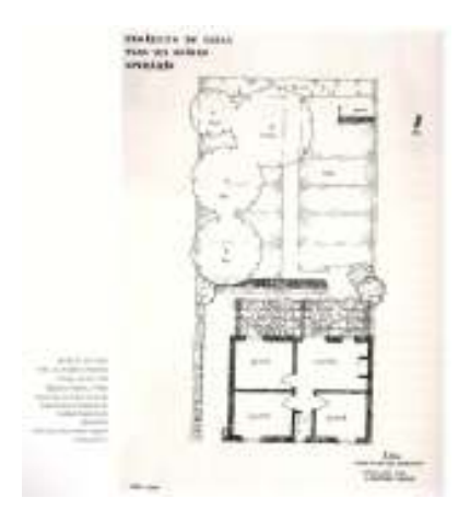
Study for a family housing unit ("casal"), with orchard and vegetable beds near mnthe house, by Gonçalo Ribeiro Telles, 1946 (in V.A., 2003)

With the growing of the city limits and the internal migration from rural to urban areas, some of the new settlements were designed for those rural migrants, creating small private productive areas linked with the individual housing functions.