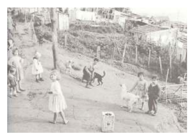
Shantitown ("Bairro de lata") in Lisboa, 1960/70?, with informal vegetable beds for self-sufficiency

Today, with most shantytowns already transformed in planned urban areas, is the work of the immigrants from former Portuguese speaking-countries in marginal areas (roadsides, as the most notorious) that constitutes for the average citizen eyes, the biggest expression of informal urban agriculture in towns.