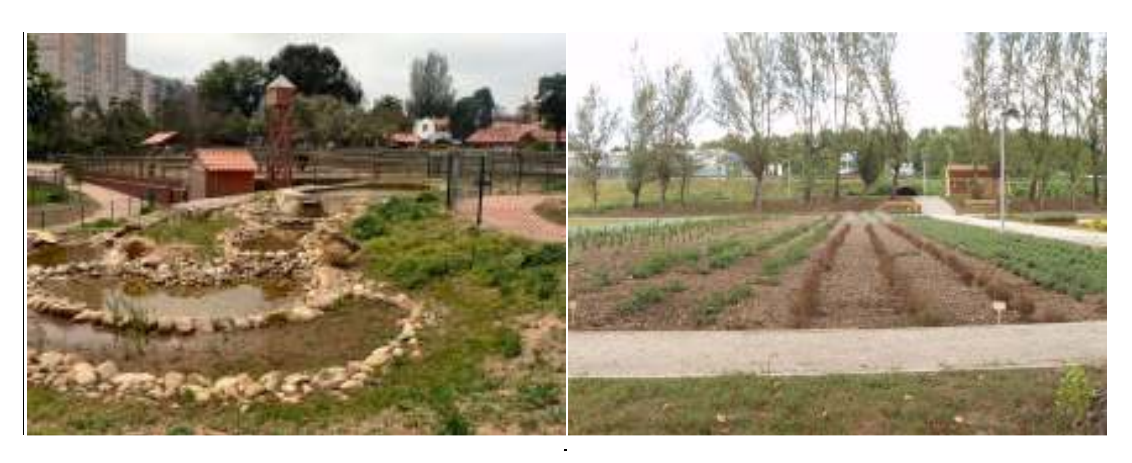
"Quinta Pedagógica dos Olivais", Lisbon "Quinta Pedagógica de Guimarães" (in http://images.google.pt/imgres?imgurl=http://upload.wikimedia.org/wikipedia/commons/8/82/Quinta_Pedagogica_-_Lago.JPG http://www.cm-guimaraes.pt/PageGen.aspx?WMCM_Paginald=16631)

Another initiative is the municipally-owned and managed sites for public acess to the or "Pedagogical allotments", where the public can visit and learn farming techniques or even farm their own plot; "Olivais Pedagogical Farm", in Lisbon, is one of the first examples (since 1996) of the first situation, and the "Social and Pedagogical Allotments" of Guimarães (since 2008) of the second. Both are very well known locally, with a great number of visitors the first and farmers the second.