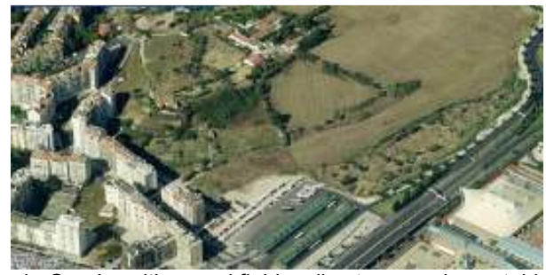
Quinta da Granja, with cereal fields, olive trees and vegetable beds (in http://www.skyscrapercity.com/showthread.php?t=603873)

In Lisbon, two big UA areas are being organized by the Municipality, but in areas where there's already informal agricultural occupation in Chelas (15 ha), and Benfica (3 ha); other UA areas will be organized or created in other parts of the city.