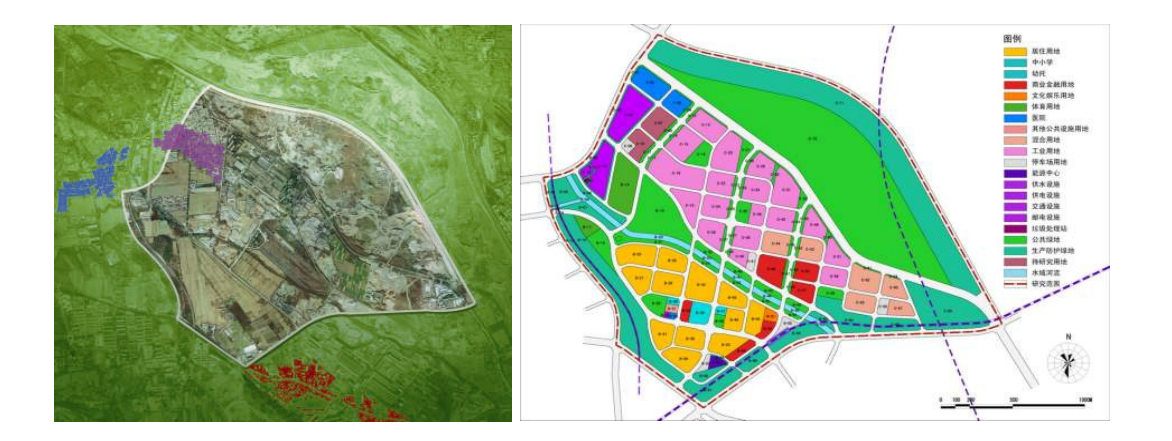
Figure 2: The Beijing Changxingdian Eco-Community Existing Condition and Proposed Land Use Plans

The planning objectives of this low carbon community include: