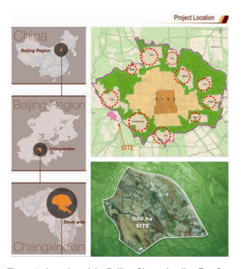
Figure 1: Location of the Beijing Changxingdian Eco-Community

Beijing city, to accommodate the city's growth. The proposed project is 500 ha in area and includes future residential, commercial, open space, research industrial park. The site will be served by a Light Rail Transit (LRT) line as part of the city-wide mass transit system. The future community will have a population of approximately 70,000 people ( Figure 1 , Figure 2 ).