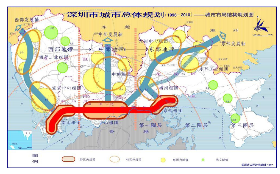
Figure 2 the Urban Structure of 1996's Master Plan