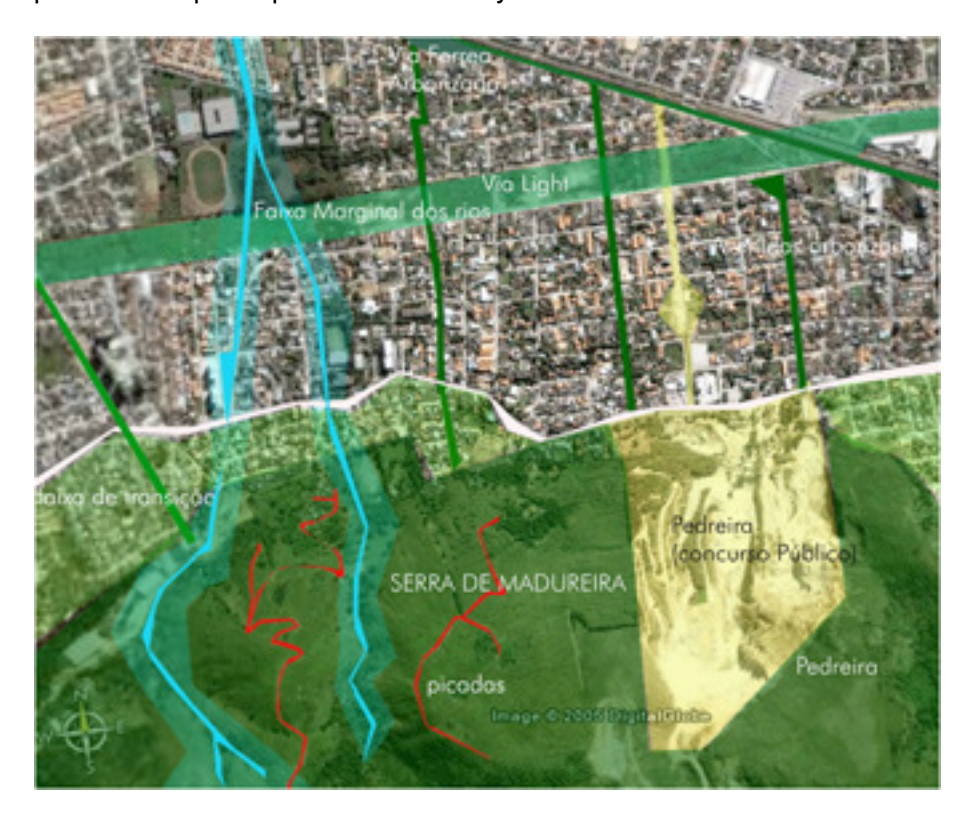
Fig. 4: expanding water and trees on the urban tissue

Considering spatial guidelines, urban vegetation connectivity is expected to occur through two main spatial structures: linear and patches. Linear structures are those areas located in sidewalks, railroads, river margins, and the like. Patches are those areas such as sportfields, squares, parks, hillsides, backyards, and the like. From these structures, green corridors and patches will participate more actively in the construction of the urban tissue (see Fig. 4).