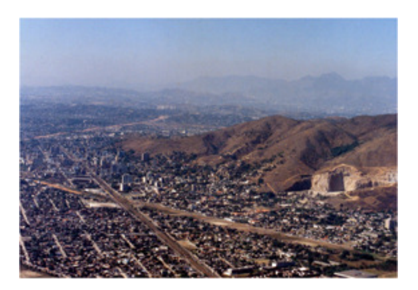
Fig 2: Panoramic view of Nova Iguaçu City and the Mountains

The idea was that the trees situated at the two large massifs, which make two of the city limits, get down to the lowland where the urban tissue is situated. The trees would get down and spread over the city along the rivers and streams which begin at the hillsides. Water and forest would get down and spread themselves over the city through different types of public open spaces – such as sidewalks, squares, parks, protected areas, and the like -, as well as over backyards, private gardens, schools, public libraries, sport areas. The spatial connectivity, built through the vegetated open space system, would contribute to improve natural processes local dynamics, besides bringing a landscape identity to urban morphology. Local community involvement would be organized through the schools, and would participate in the construction of directions and strategies for trees planting and maintenance, following therefore the Neighbourhood-School Programme proposal (see Fig. 3).