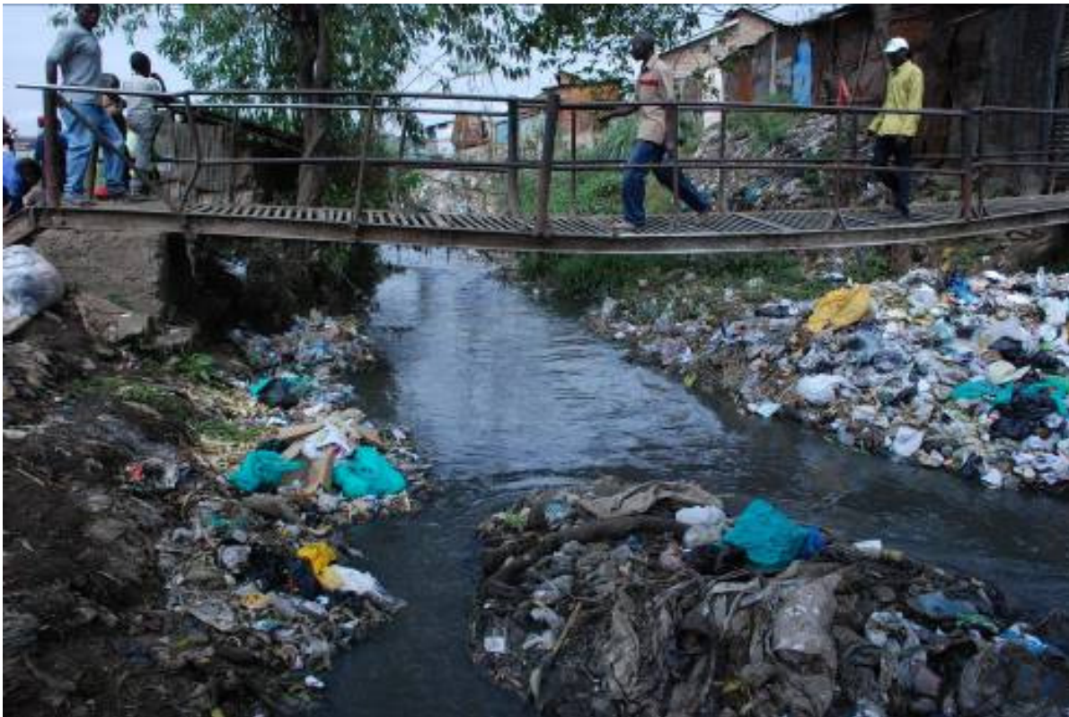
Plate3-2: Inadequate Waste Water and Solid Waste Disposal