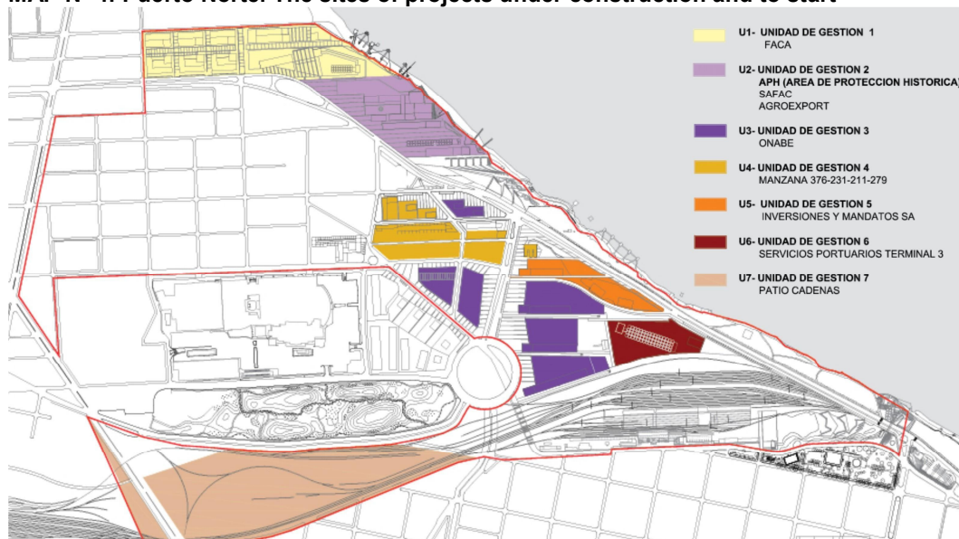
MAP N° 4: Puerto Norte. The sites of projects under construction and to start