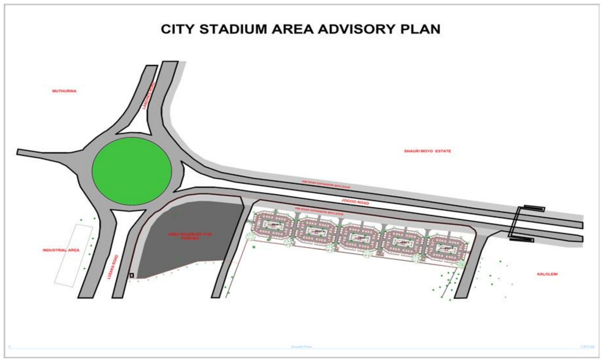
Figure 4.1: Typical Advisory Plan: The Outcome of Regularization.