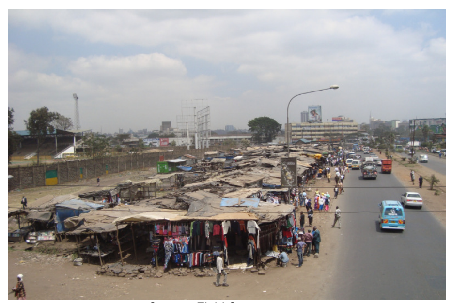
Plate 1.1: Bird's Eye-View of the City Stadium Jua Kali Trading Site.