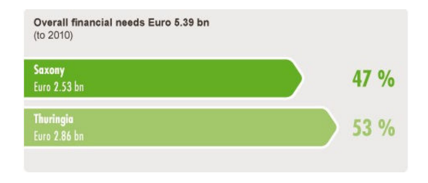
Fig3, the financial structure of Wismut GmbH

As an institutional donee, Wismut GmbH is financed by the federal government which is funding this exceptionally large environmental project and has committed a total of € 5.4 bn until 2010.Funding of Wismut GmbH is based on annual work plans and project budgets.