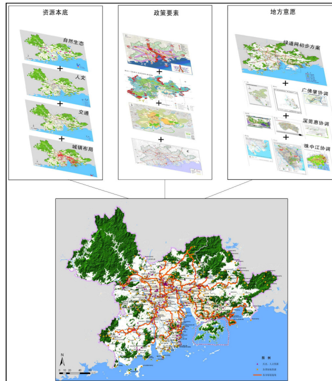
Fig.4: Schematic view for the analysis of superposition of impact factors

This definition gives prominence to the connectivity and accessibility of greenway, and emphasizes the comprehensive utilization of existing resources. In practice, the following three aspects shall be mainly considered for the connectivity and accessibility of greenway, such as the route selection of greenway: