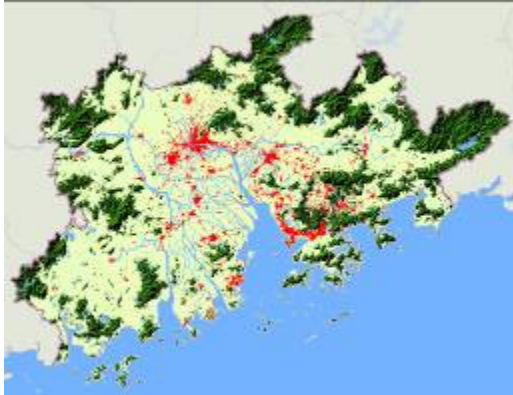
Fig.1: Distribution of urban built-up area of Pearl River Delta in 1995

Source: Song Jinsong and Song Yun (2008) “OR model” and simulation of the growth form of future space of Pearl River Delta