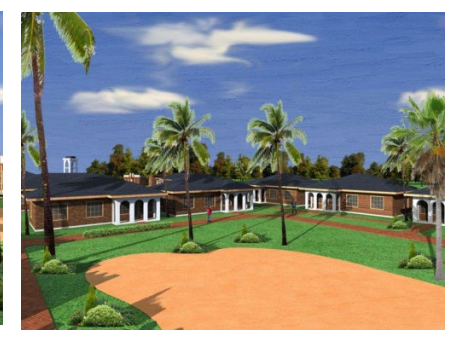
Figure 3: Images of the proposed Amani village.

Positioning of the buildings on site was governed by the actual location of trees on site to ensure that only countable trees will be brought down during construction. The character of the Village is a resultant product of the interrelationship of various elements, creating a distinctive recognizable area defined by dwellings, walkways, open spaces and social/commercial institution. The area taken by the roads (hard landscape) have been reduced to less than 4% of the total area of the site ensuring minimal surface run-off as rainwater will have adequate area to percolate.