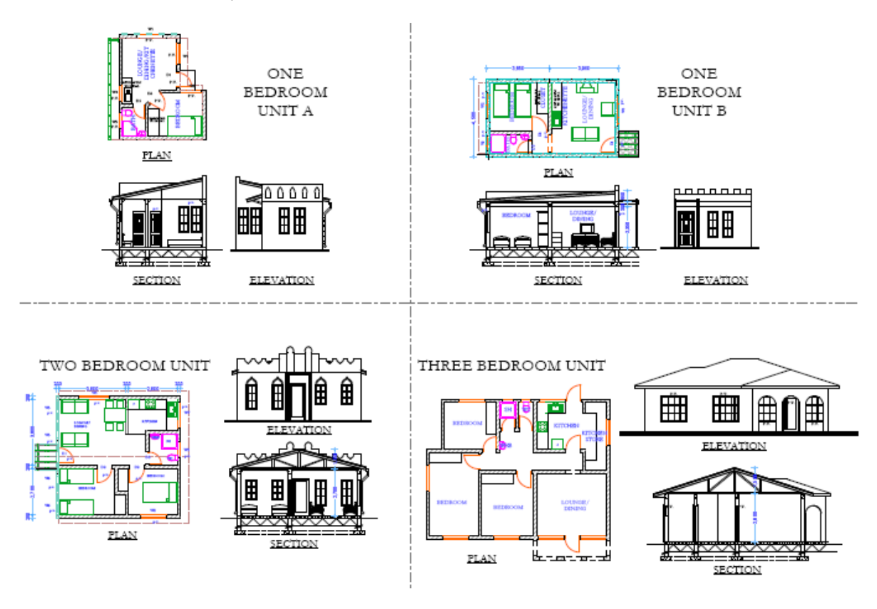
Figure 4: Drawings of the units.

overheating during the day are thus minimized. More so, more consideration was given to the design of the windows. The casement type windows are mainly vertically oriented with height to width ratio of approximately 2:1, and a setback of 100 millimeters from the façade. The windows are divided into two by a transom with the top part made of horizontal timber louvers and glass panels whilst the lower part of timber panels. In overall, the windows will ensure control of light indoors, maintain privacy and cross ventilation.