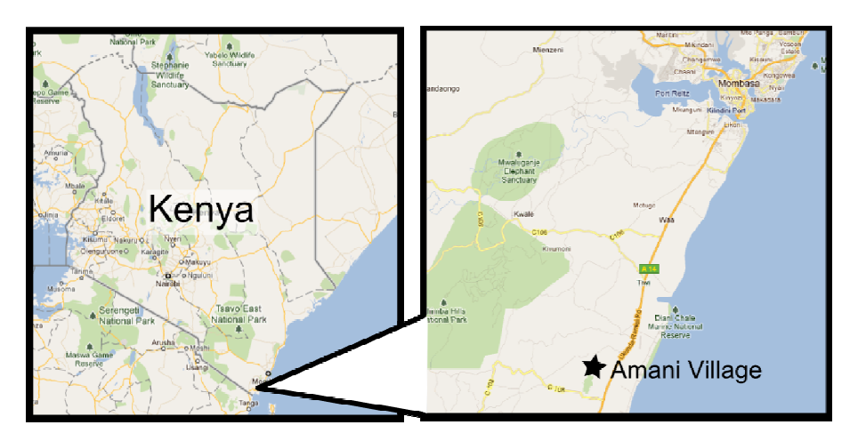
Figure 1: Location of site.

This paper is an analysis of Amani Village - a low-cost, eco-conscious pilot development in Ukunda, Kenya. The development began in April 2011 and is scheduled for completion in February 2012. The project is being funded by the Asante Foundation, dedicated to alleviating poverty in Kenya through enterprise. Amani Village consists of 59 units: 32 single bedroom homes, 10 two bedroom homes, 5 three bedroom homes, 6 commercial spaces, and a nursery school. Each home will have access to clean water, electricity, and clean ownership of the property. The development will provide affordable, safe, and sanitary housing to an estimated 285 people.