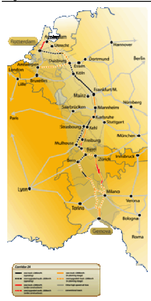
Figure 2: The corridor 24

this was the least active and also represented level. Compared to the importance the development of this type of infrastructure plays in terms of its ability to create territorial cohesion and strategies for sustainable spatial development. CODE24 has set a goal of complementarity in a logic of cooperation and support with respect to the interest groups already in action.