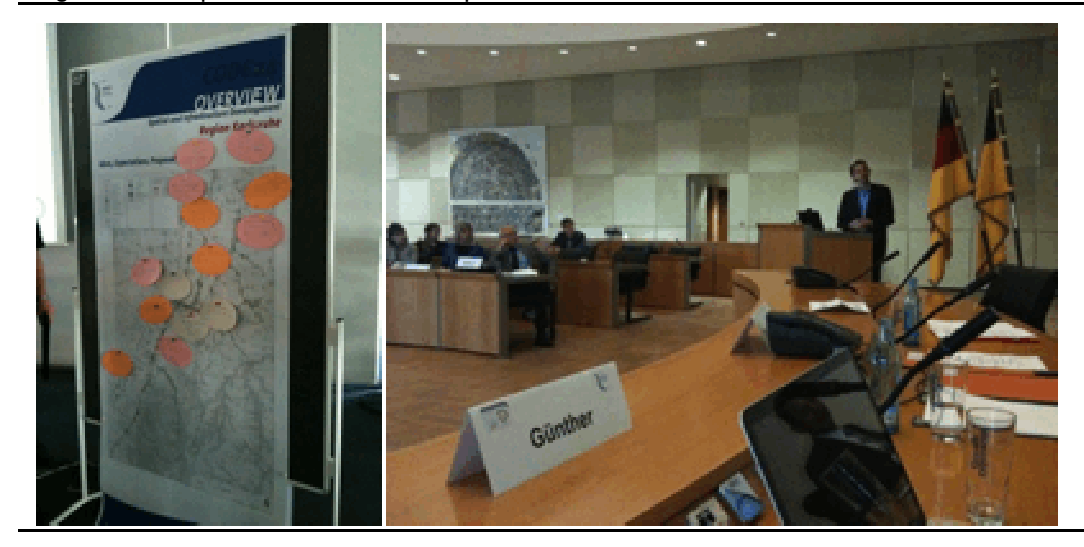
Figure 3: Sample Code 24, Workshop

2011 and 2012 with the objective of exploring some specific cases and prepare the ground for the elaboration of the content of the common strategy.