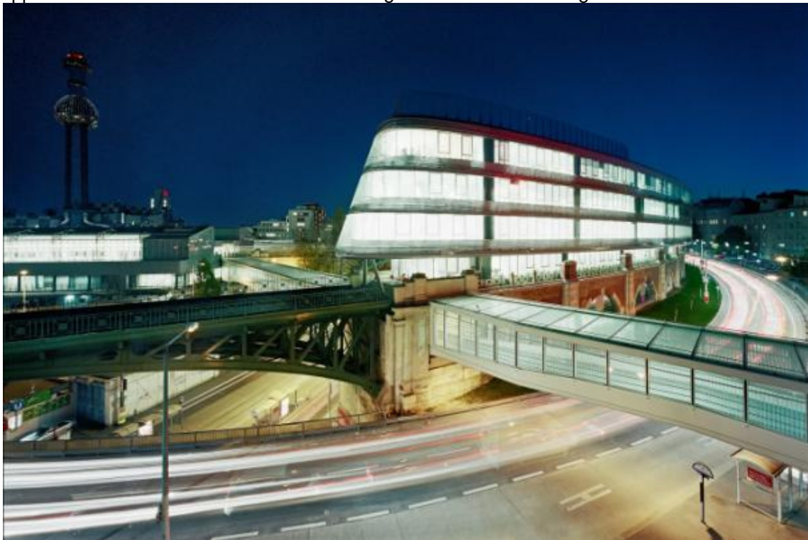
Fig.13 Nocturnal view of the office building Skyline Spittelau

Silja Tillner, Architect and Urban Designer in Vienna, Austria