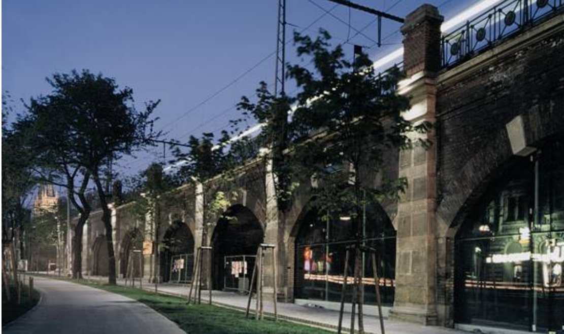
Fig.11 Illuminated arches and median with well lit pedestrian and bicycle paths. In the background the church towers at the Uhplatz serve as an orientation landmark.

Gürtel bridges: Mounted on the back walls of the abutments, lateral spotlights illuminate the bridge zones. Spot lighting the bridge pillars further accentuates the Stadtbahn viaduct during the evening. The lighting details emphasize the architectural significance of the Stadtbahn bridges as prominent gates to the inner city rather than mere functional overpasses.