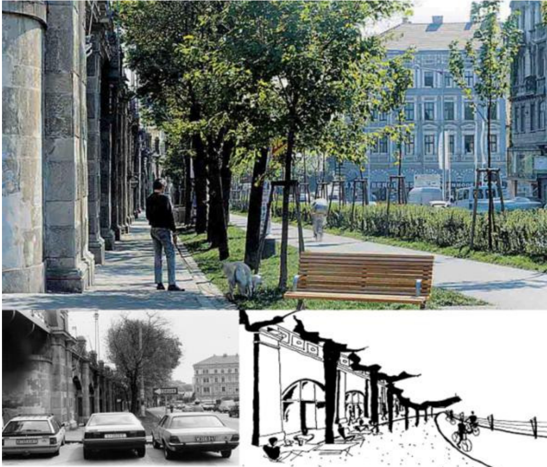
Fig.12 The newly designed open spaces with a second row of trees and enlarged green space