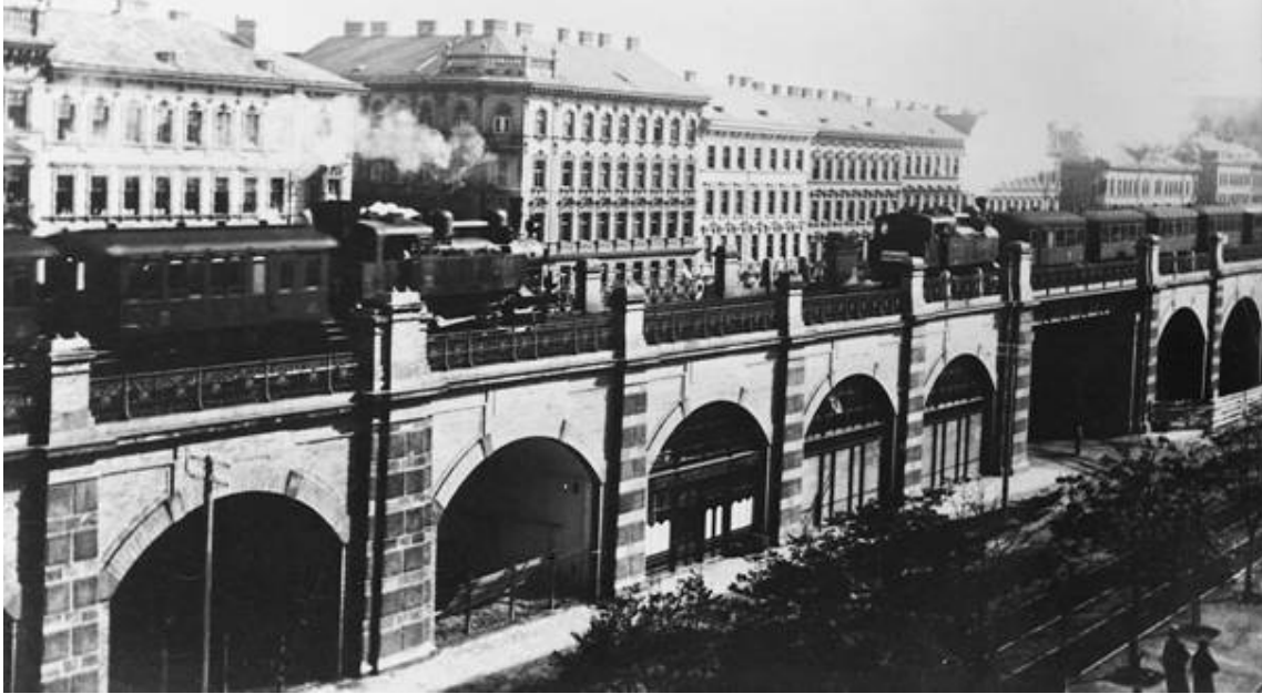
Fig. 3 The Stadtbahn viaduct was built in the center of the Gürtel Boulevard from 1893 -1898 and was constructed to support heavy loads, e.g. trains with steam powered locomotives.

evolved as links between the city and its environs. In 1893, Otto Wagner developed this structure into an urban expansion concept for Vienna. In this, he principally differentiated between the functionalities of the main radial thoroughfares and the tangential roads.