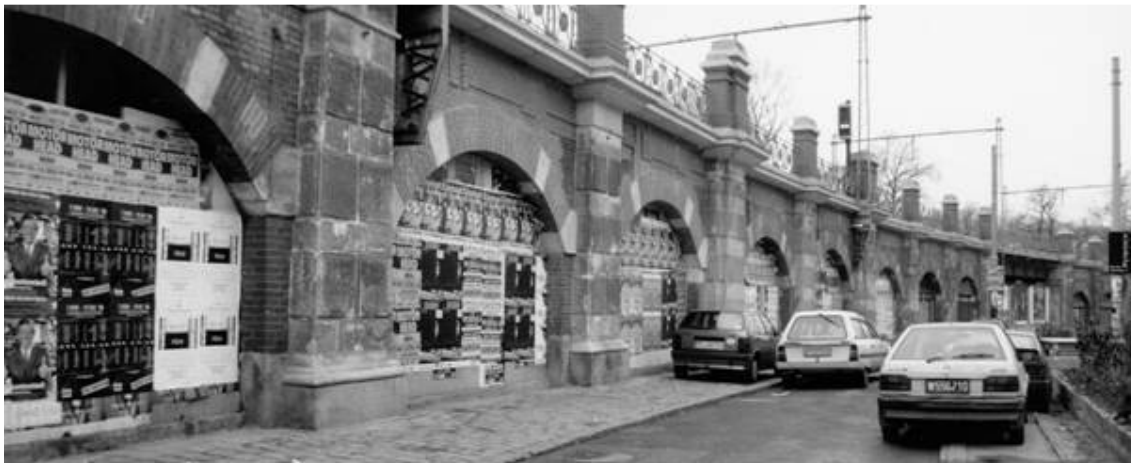
Fig. 6 Some of the vacant arches were even boarded up. The side lanes were used for illegal parking.

In the 1950s and 1960s, the popularity of automobile traffic led to an enormous increase of cars travelling on Vienna's streets. The formerly tree-lined Gürtel Boulevard had reached capacity. Green space was reduced for the sake of street widening, asphalt replaced grass and soon the viaduct had become an isolated island in the center of an eight lane inner city highway. The increase in car traffic led to the further decay of the area: the building stock fell in disrepair and a red light-district spread along the Gürtel street and the connecting roads. The negative image of the whole Gürtel neighborhood led to further erosion and devaluation of the area and the adjacent properties. Negative press in numerous articles criticizing the traffic nightmare, environmental pollution and the social degradation of the red light district, was lamented. The Gürtel area was given up as a "hopeless" case.