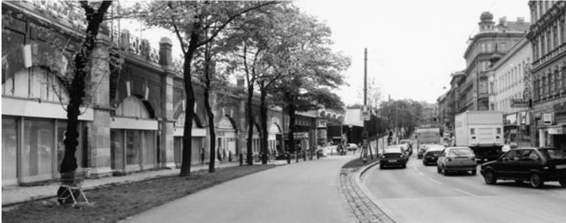
Fig. 5 After World War II, from 1950 until 1995, many of the arches were vacant and fell into disrepair. Former green space was paved over to accommodate the growing number of cars.