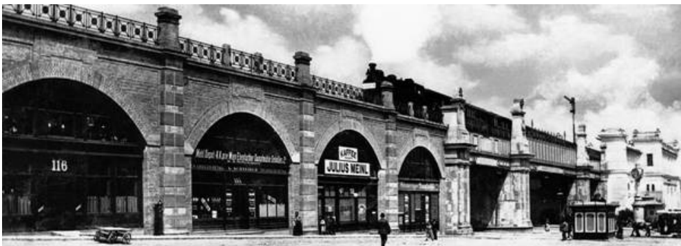
Fig. 4 Shops and restaurants as active uses underneath the Stadtbahn viaduct in 1900

From its inception, the Vienna Stadtbahn railway line along the Gürtel was conceived as a key player in the high volume traffic. 1 It was built between 1893 and 1898, almost entirely as an elevated railway. The Vienna Stadtbahn was planned and executed by the Imperial and Royal State Railways, which opted for a massive masonry viaduct for the Gürtel and Otto Wagner was later commissioned with the aesthetic concept for the Stadtbahn. From the very beginning, the planners of the Stadtbahn wanted the arches below the line to be used for different purposes and referred to the “lease of viaduct arches”. Otto Wagner designed façades to close the arch apertures to create usable space for small businesses. By means of one horizontal partition and two vertical supports, he structured the arches into six sections. Due to the varied topography which the Gürtel traverses while encircling the city, the height of the Stadtbahn arches fluctuates between single and triple levels. Thus, Wagner’s façades were flexible. All of Wagner’s facade designs are characterized by a high degree of visual transparency, i.e. a maximum of window and display space and a minimum of support elements.