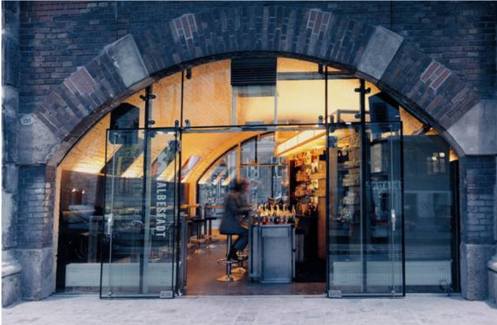
Fig.10 A music club and bar locates in a renovated arch.