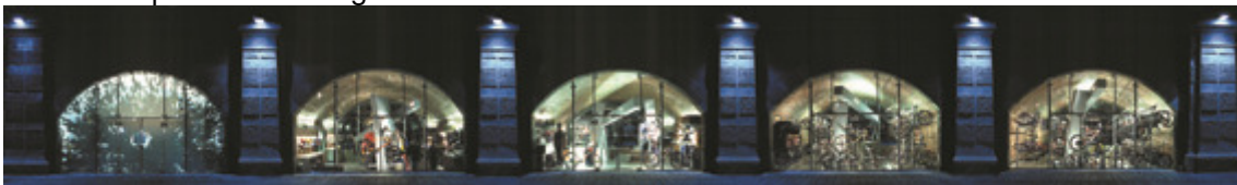
Fig.9 Newly renovated arches with transparent glass facades accommodate a popular bicycle store

To counteract the marginalized nature of the Gürtel, the new open-space design of the Stadtbahn arches and businesses strove to increase utilization, thus populating the area to garner a degree of social control. The concept strove to transform the Gürtel's forgotten arches into a lively avenue of cultural and entertainment venues; where the city's youth could enjoy music clubs and a progressive nightlife, while residential districts were relieved from noise related disturbances. The arch tenants both appreciated the unique atmosphere of the old brick vaults of the viaduct, while at the same time wished to take part in the interesting new development and image creation for a hitherto faceless area.