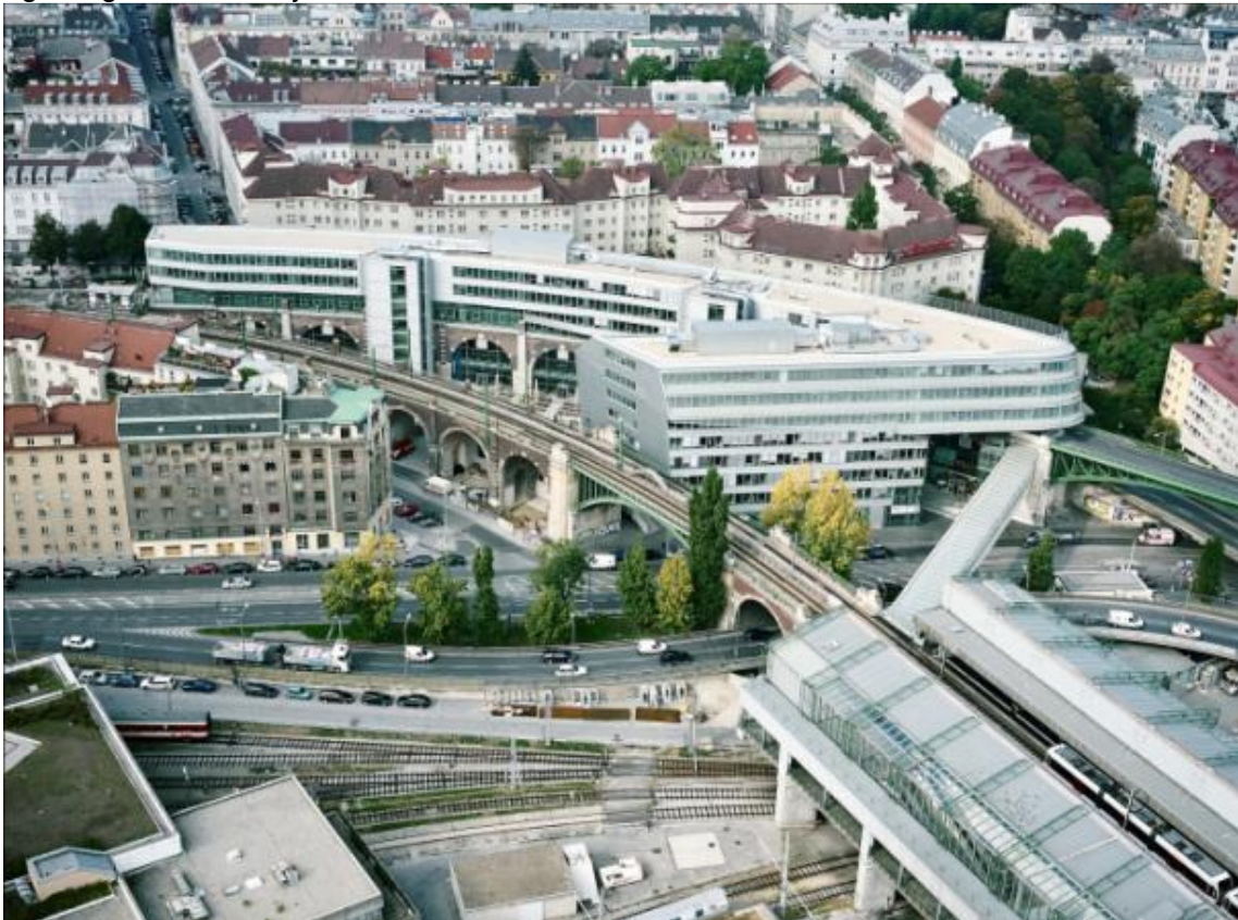
Fig.13 Aerial view of Skyline Spittelau on top of the former railway line

Hovering above the now-obsolete Heiligenstadt railway line and following the curve of its track, Skyline Spittelau ensures the cultural preservation of Vienna's historic viaducts while signaling the area's rejuvenation.