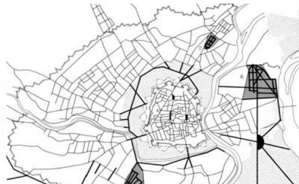
Fig.2 The inner and outer city walls of Vienna at the end of the 18 th century

The Gürtel thoroughfare dates from the last third of the 19th century, when Vienna was a growing metropolis. The inner and outer city walls were dismantled and replaced by two concentric boulevards: the Ringstrasse, (the inner circle of the old city dominated by the court, the aristocracy, church and haute bourgeoisie) and the Gürtel (the outer around the middle-class, business, proletarian world of suburbia). The Ringstrasse was primarily a vehicle for demonstrations of status and power while the Gürtel served housing and traffic purposes.