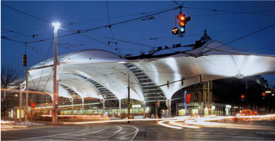
Fig.13 Urban Loritz Platz at night, covered with a membrane roof.