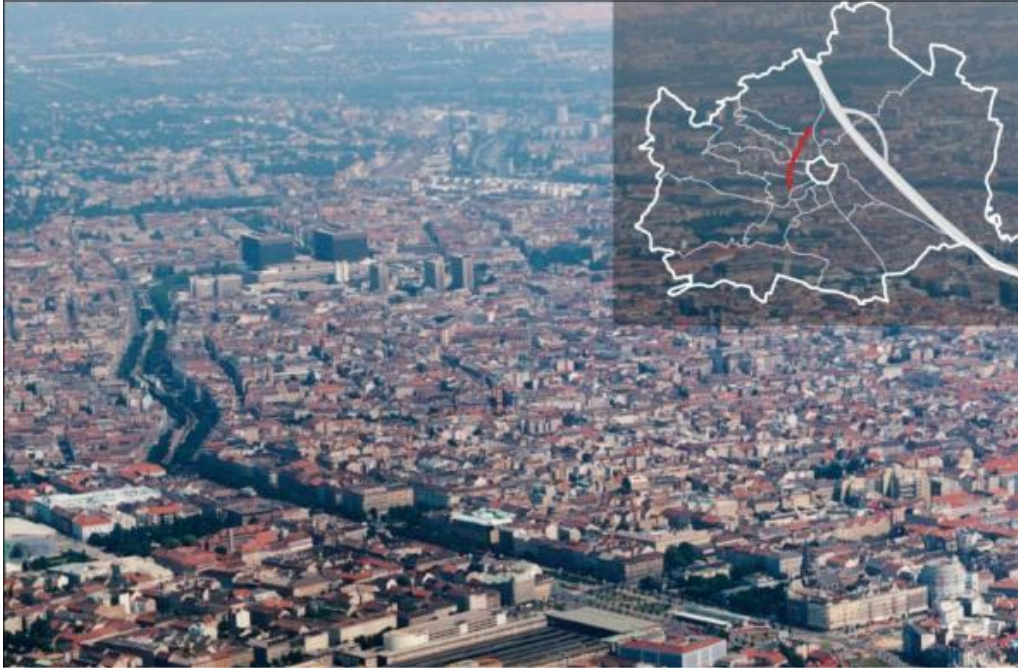
Fig. 1 Aerial photo shows the URBION zone along Gürtel, top right: location of the Gürtel in Vienna

The city-wide revitalization proposed new urbanistic uses and potentials to trigger functional improvements, spurring an image transformation of the previously derelict zone.