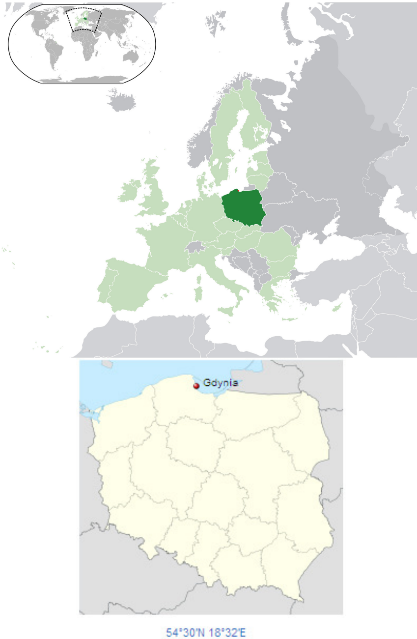
Fig. 1. Location of Gdynia on the maps of Europe and Poland.