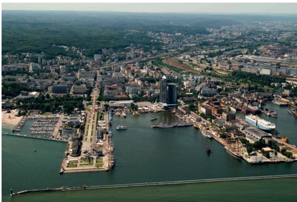
Fig. 2. Gdynia waterfront and city center.

Gdynia exhibits a clear structure of the basic land use pattern established before WW2, although it is filled with a variety of post-war development patterns. It contains coherent historical urban fabric of the city center and the closest surrounding districts, large port and industrial areas, elements of social realism planning, new gated residential developments, and some garden type settlements. As the development potential of the city center is nearly exploited and socialist multifamily housing is not easily adaptable for changes, the city develops west, overtaking its rural land reserves.