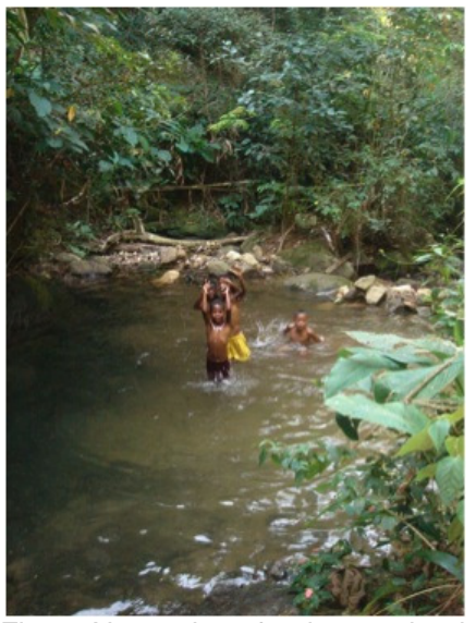
Fig. 4: New values for the nearby river.

Many of the rivers and streams, despite the state of environmental degradation, are still alive and therefore able of being recovered as urban environmental infrastructure, as well as productive landscape in a variety of ways. For this end, we must recognize social and environmental values in landscape transformation. As argued by Corner (1999), when regarding landscape as a verb, not just as a noun, to underscore its processual nature, and its ability to enrich local cultures.