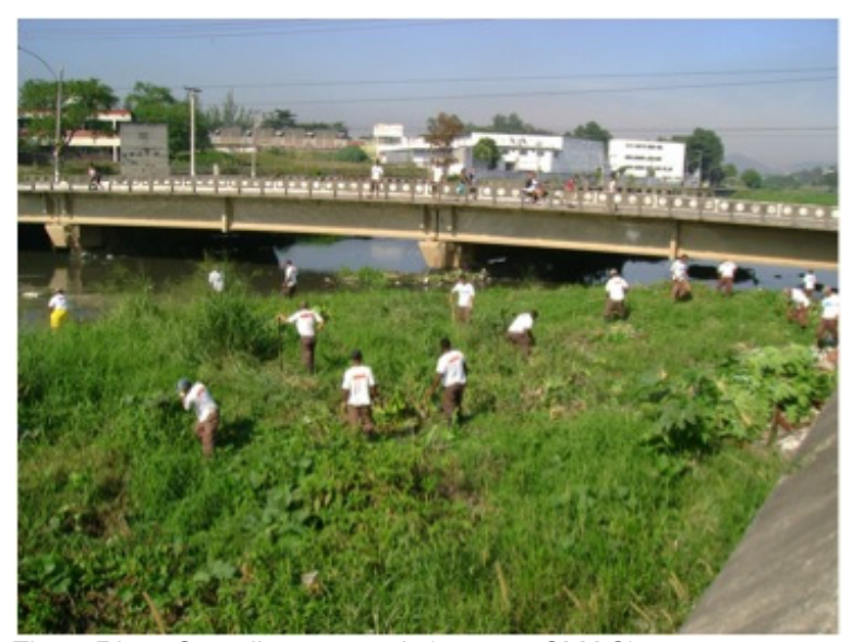
Fig.1: River Guardians at work.

The Rivers' Guardians were selected from favelas or other low income settlements located nearby the rivers and crooks. The selected dwellers, preferably those unemployed, were hired to work in the cleaning and maintenance of the watercourse and its respective bank closest to their community. For this end, they received proper training through courses organized by the Mayorship, where they receive basic information concerning environmental education, cleaning procedures and proper treatment of the collected litter. Selection and training was conducted by technicians for the River Guardians Program in partnership with the Environmental Education Program, both from SMAC. The team was then formed with local residents, and one leader was selected among them. Once the team was completely organized, the River Guardians began their activities under the supervision and coordination of SMAC's technicians.