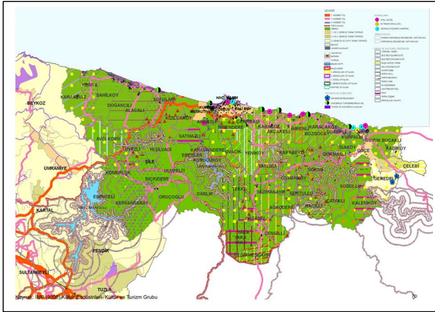
Figure 1- Physical and Socio-economical Potentials of Şile

This study focuses on the district of Şile as a case area located at the fringe of Istanbul, which falls into the first category according to the classification above. The findings of the research carried out during the making of the Istanbul Metropolitan Master Plan which started in 2005 and the Şile Master Plan 1 are evaluated in comparison to the themes of 'regeneration of rural areas' and 'development of rural areas according to principles of sustainability'. The district of Şile, which has the biggest surface area but the smallest population (the surface area is 79.080 Hectares, covering 15% of the province of Istanbul, and the total population in 2000 is approximately 37.000 which counts for 0,4% of the whole population of Istanbul) amongst the districts in Istanbul, has a land that is covered by 77% forest areas and 18% agriculture areas. In Şile, which has a very limited amount of land that is suitable for settlement, there are 57 villages with an average of 300 inhabitants, most of which are located in the forests (IMM-IMP, 2007). The three lane highway that connects Şile to Istanbul via Ümraniye, and the two lane roads that connect it to Kandıra via Ağva, and to Gebze make up the main transportation system of the district (Figure 1).