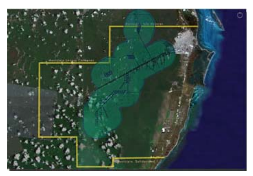
Figure 7. Influence area.

The urban growth boundary (UGB) between Benito Juárez and Isla Mujeres and the delimitation of all the right-of-way in the Nichupté bridge.