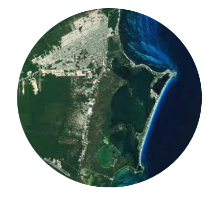
Figure 6. Satellite image of Cancun. 2012