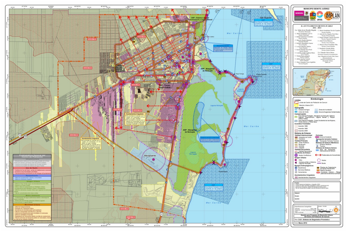
Figure 7. Integrated Diagnostic Map of Cancun. 2012