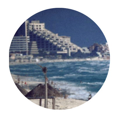
Figure 5. Sample of the new resorts

In the last two years, over the Bonampack avenue in downtown Cancun, it began the construction of large real state developments characterized by high rises buildings.