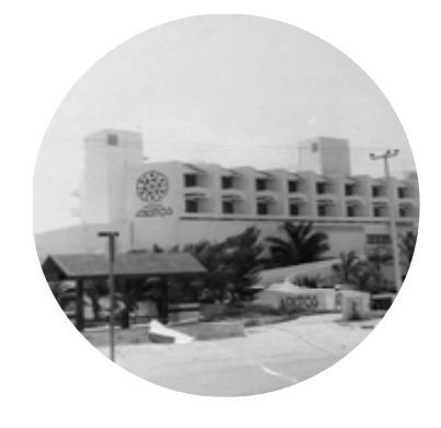
Figure 4. One of the first hotels in Cancun