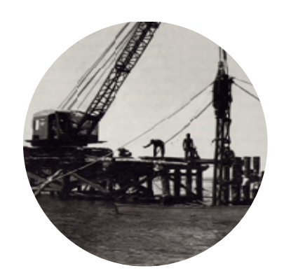
Figure 2. Workers on a dock

In 1970 a handful of workers placed a camp in the north-east region of the state of Quintana Roo with the mission to bring off a new city. The virgin jungle and the vermin had no effect for the five thousand workers and the two hundred million pesos that will be invested in the construction in 1971. Just one year after the kick-off.