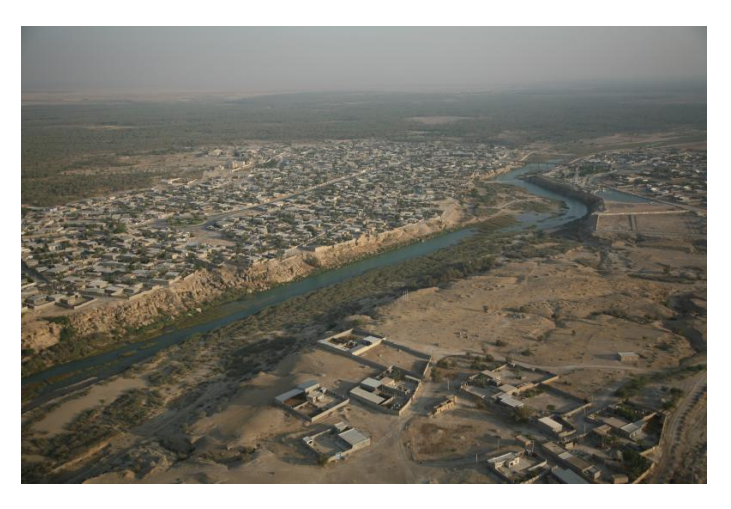
Figure 1: Bushehr city from top

The most vulnerable people are those whose livelihoods directly depend on nature and on the ecosystem services that nature provides and Bushehr citizens are not an exception.