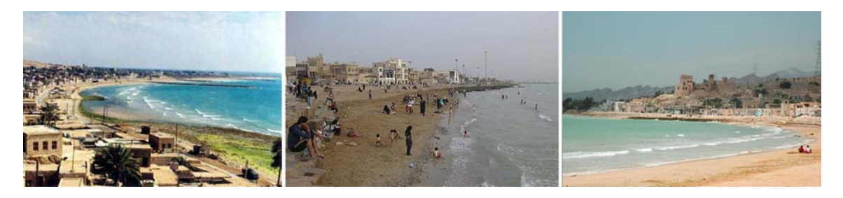
Figure 3: Bushehr city in 1935 (Left), Current (Mid.) and prospectus Socio-ecological Resilient Bushehr (Rendered Image)

Human alterations of ecosystems and ecosystem services shape both the threats to which people and places are exposed and their vulnerabilities to the threats. Consequently, the same alterations of environment can have very different consequences, depending on the differential vulnerability of the receptor systems. Therefore, in the following, the driving conditions of vulnerability issues for Bushehr have been well characterized at least at a general level (figure 3).