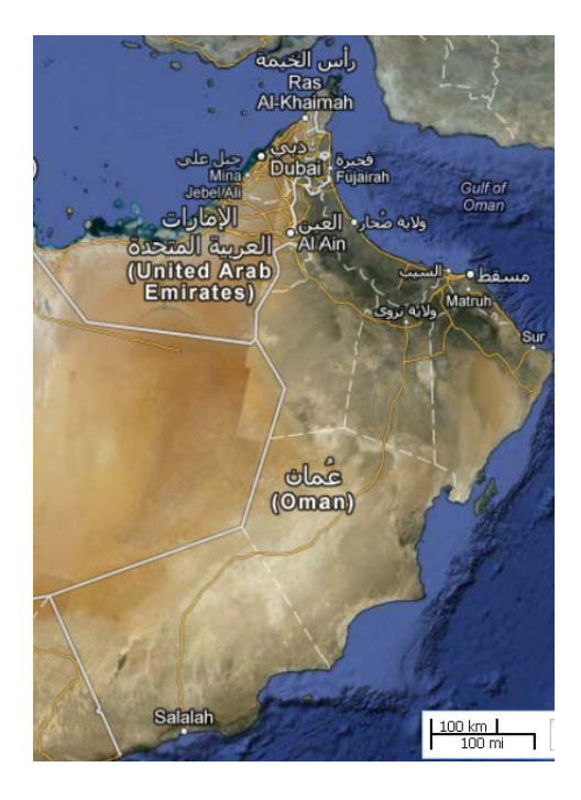
Figure 1: Sultanate of Oman satellite image