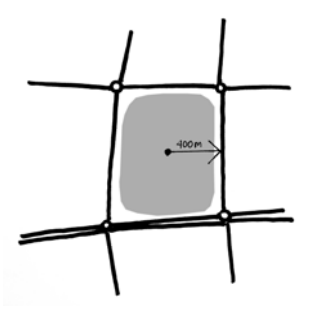
Figure 1: Microdistrict Unit

The scale of the unit itself, the scale of the buildings, absence of transitional objects/spaces and overall typization dissolve the sense of belonging; make «Mikrorayon» the generic unit, where individual is not taken into account.