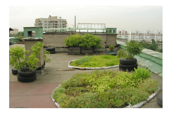
Figure 3: The Roof Garden by Alla Sokol. http://www.the-village.ru