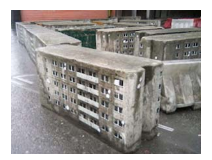
Figure 2: Microdistrict. Street Art.