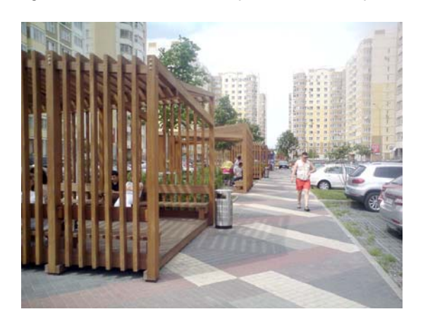
Figure 7: Marfino Pavilions.