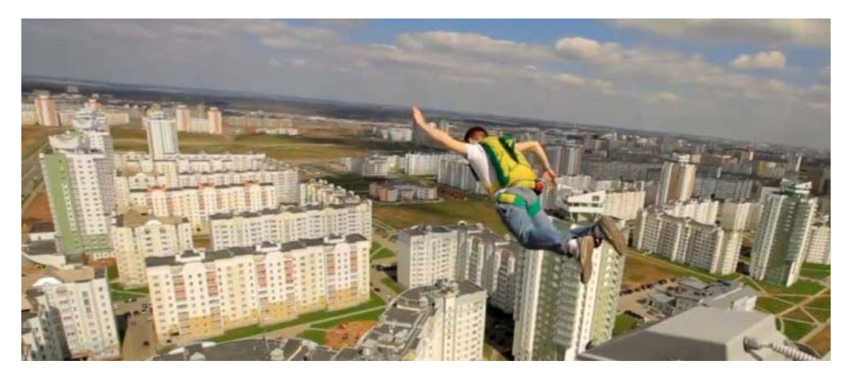
Figure 9: Parachute jump from the roof of a 25-storey building in Kamennaya Gorka [5]

The analysis of the Kamennaya Gorka 1 district has raised a lot of issues: