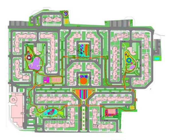
Figure 4: Marfino Landscape plan. PlanAr Studio