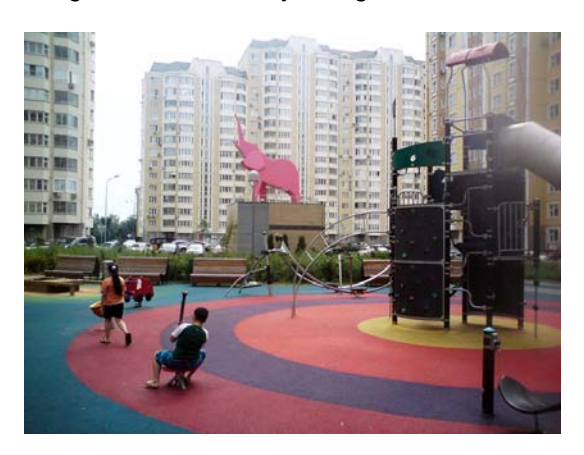
Figure 6: Marfino Iconic Sculpture.