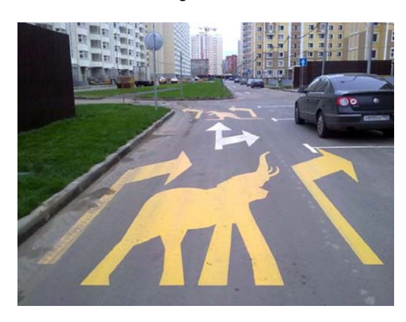
Figure 5: Marfino Wayfinding. PlanAr Studio