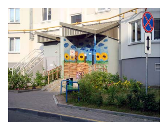
Figure 10: Kamennaya Gorka 1. Local Art.