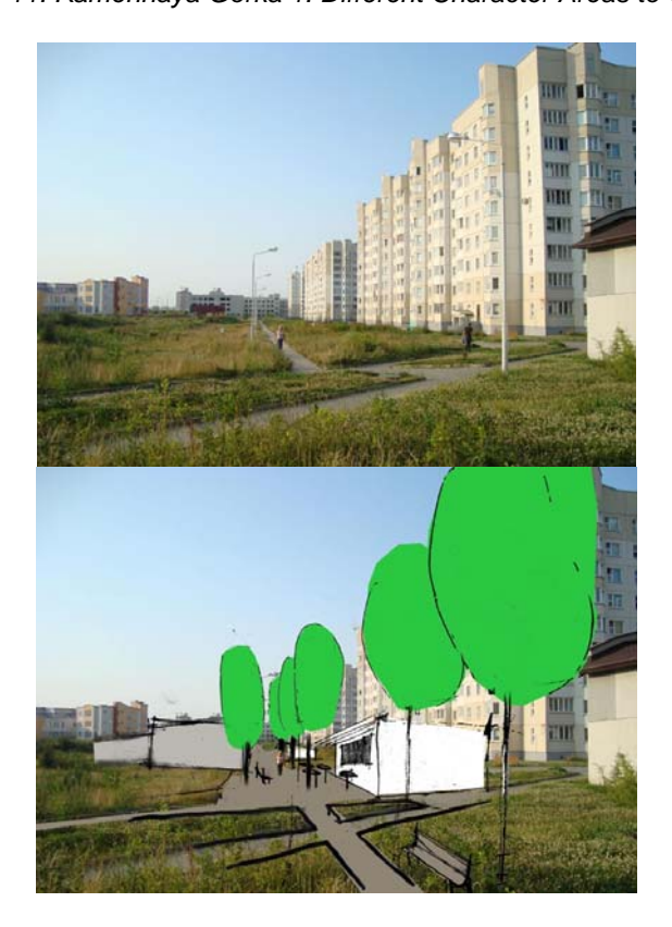
Figure 12: Kamennaya Gorka 1. The Inner Boulevard