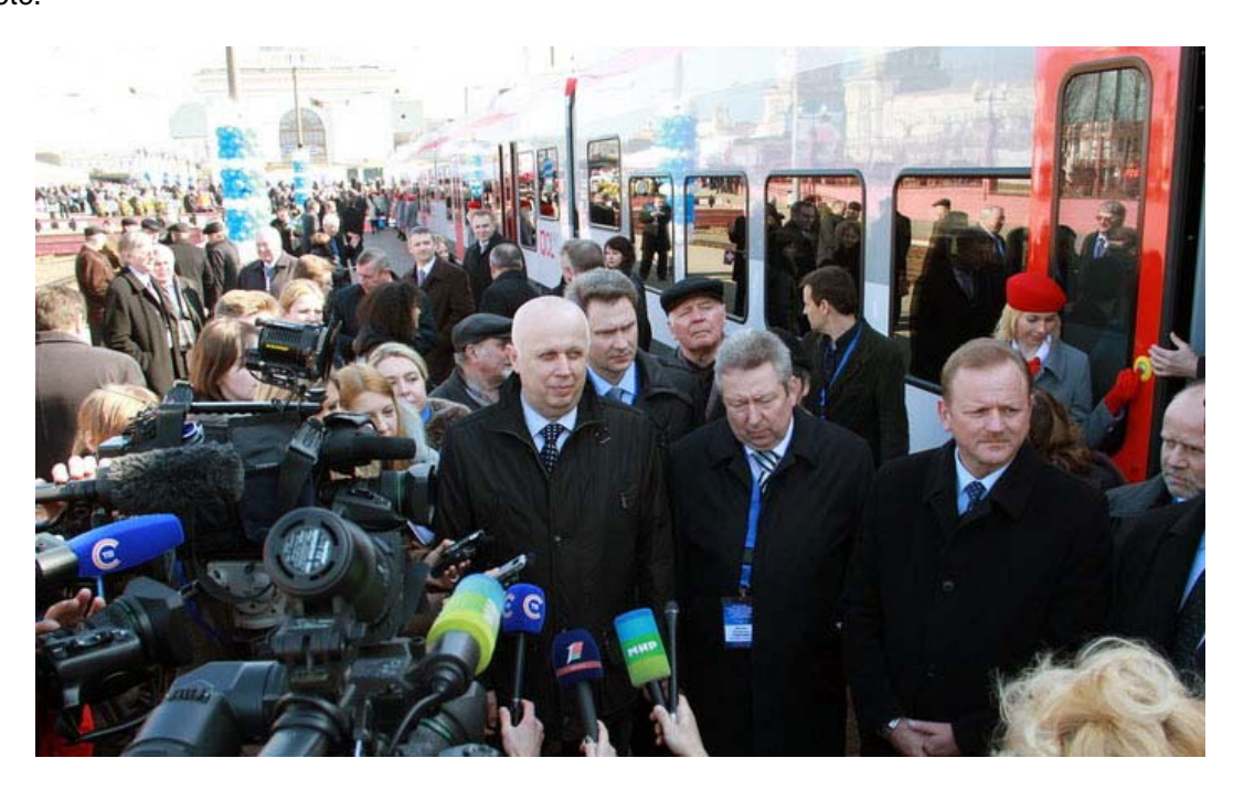
Figure 1 – Presentation of the new train carriages for the inner-city railway in Minsk, 2011

After three years of active implementation the program did not meet its main task – the number of passengers using rail transport for local communication has not increased significantly.