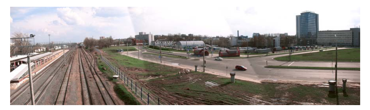
Figure 2 - "Minsk-Paunochny" station and adjacent territory, 2012

activities. The activities take into account exclusively issues that are associated with the quality of train carriages and increase in the capacity of individual lines. At the same time, the areas adjacent to the stations remain unaffected by urban development transformation (Figure 2).