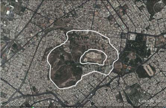
3a:Temple of Diana -East Attica in rural-urban space 3b:Parthenon, Acropolis- Historic center of Athens Fig. 3. Indicative delimitation of zones A and B in archaeological sites in rural and urban space