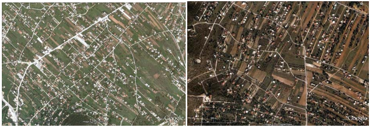
1a. South of Athens: the "amorphous" space 1b East of Athens around the international airport area Figure 1. Unplanned urban development and uncontrolled urbanization in Attica region (around Athens)

The building up (legally or illegally) of the countryside near or into protected sites exacerbates the downgrading of these places, which are also core tourism assets. This leap in urbanization has led to the erection of a cement wall along the entire length of the coast, thanks to the construction of a mass of hotel and tourist complexes as well as settlements of second-homes constructed often illegally as for instance in the region of Attica (see Figure 1). As a result, cultural built heritage sites, existing in these areas, is facing major difficulties due to unplanned urban development and uncontrolled urbanization.