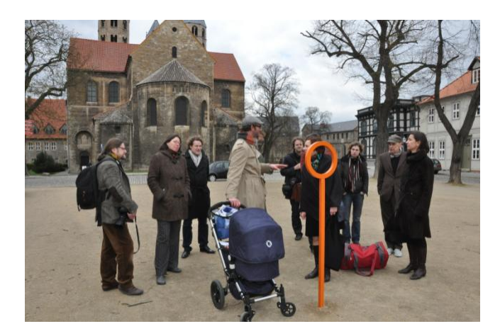
Fig. 2.5: Halberstadt – Domplatz - Cultivating empty space – training track for seeing: members of the board of trustees and the steering committee test the effect.

This innovative approach was also reflected in the temporary cultural events. For instance at the concluding IBA event in 2010 a concert and dance performance took place in an empty indoor public swimming pool. The performance was overlaid by projections showing people swimming in the baths, many of them local citizens who were attending the performance – a poetic conclusion that allowed the circle to be completed. (Fig.2.4)