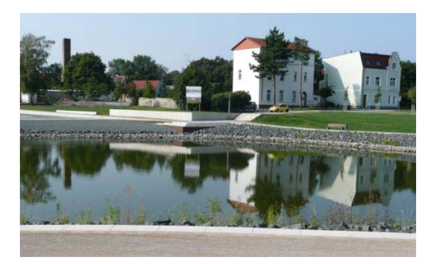
Fig. 2.7: Staßfurt – Relinquishing the old centre, controlled flooding created a lake in the hollow. The site of the former town centre is now occupied by an attractive park that incorporates the local history.