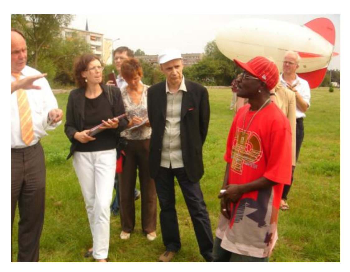
Fig. 1.3: Discussion between Minister Daehre, experts from the Bauhaus and the IBA board of trustees, and citizens in Dessau against the background of the "Claims". The city of Dessau offered interested citizens the chance to "sponsor" a piece of landscape measuring 400 m<sup>2</sup> in area.