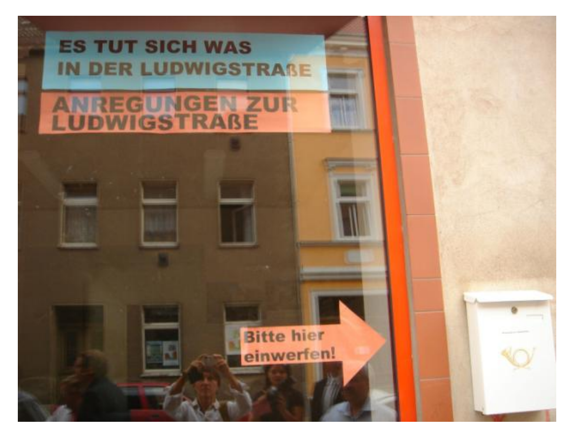
Fig. 1.2: Köthen – using homeopathy as an urban planning aid in Ludwigstraße, a street with numerous vacant buildings. Spectacular actions such as "temporary switching-off the street lighting and illuminating the vacant buildings" were instigated as a way of "shaking the residents of Ludwigstraße out of their slumber" and vividly illustrating the problem of vacant buildings.