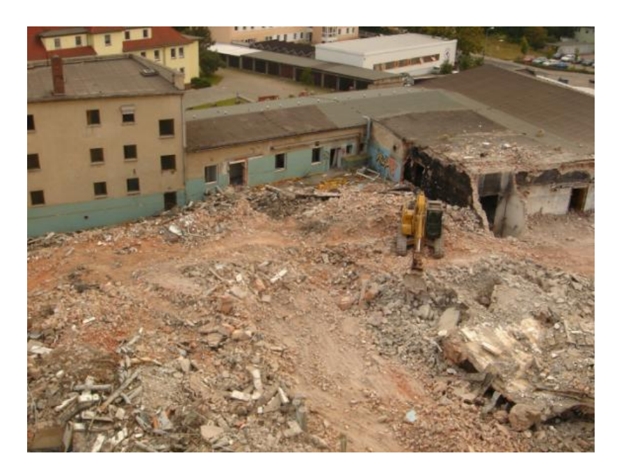
Fig. 2.1: Urban redevelopment in Dessau – difficult and protracted negotiations with the owners were necessary before it was possible to demolish a number of empty buildings and to make the strip of landscape a reality .