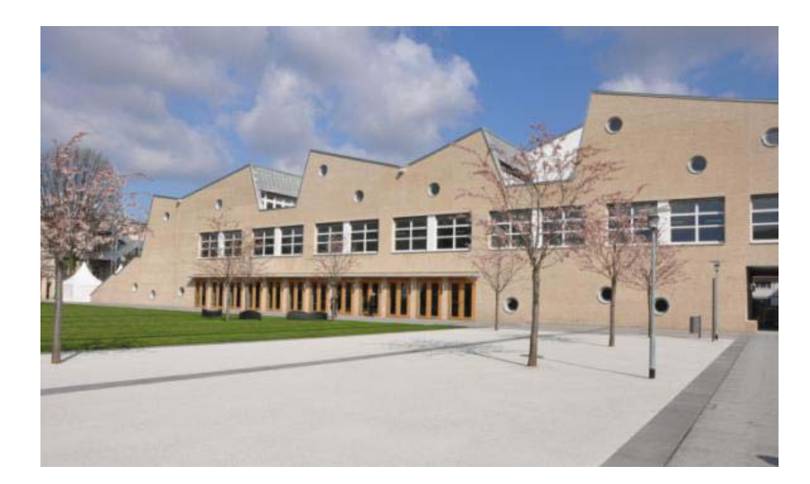
Fig. 2.6: Aschersleben – new and converted buildings for the educational centre with landscape design in Bestehornpark