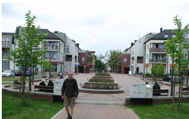
Fig. 5. New town centre in Pruszcz Gdański

This case proves that high quality of public spaces can convert new residents from a group of strangers to active community - integrating them around town aesthetics as a common value.