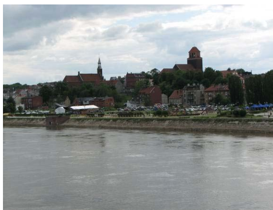
Fig. 4. The Vistula Boulevard exposing the panorama of The Old Town