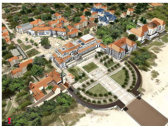
Fig. 7. The Haffner Centre

The taken actions did not manage to stop the decline of population. The property prices are among the highest in the country - comparable only to the capital. This model of policy towards public spaces does not seem to be socially fragile, nevertheless Sopot since XIX century holds an image of an exclusive location. The results of opinion polls show that the residents appreciate the increased attractiveness of the town and living environment, security and cooperation among local society (Chabierska 2008).