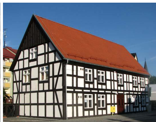
Fig. 9. Rebuilt model of traditional house