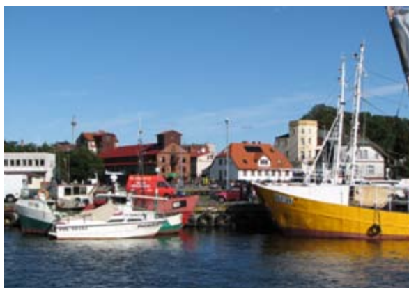
Fig. 8. Relics of the fisheries heritage

This strategy seems to be stable but incomplete. Next to newly arranged area is located a vast post-industrial zone is waiting to be invested. Tourism - function chosen as principal - seems close to reaching the maximum stage of development. What will be the next strategic choice? One of options is development of residential function ( vide the case of Pruszcz Gdański), however in current condition of the real estate market It seems rather unlikely.