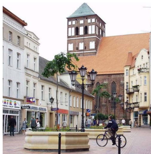
Fig. 11. Basilica Minor and a street with new "historicist" character.