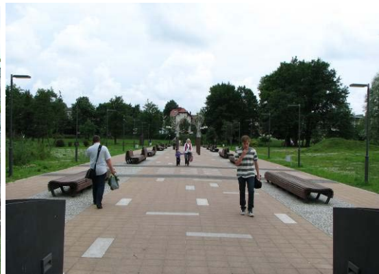
Fig.6. Newly arranged municipal park