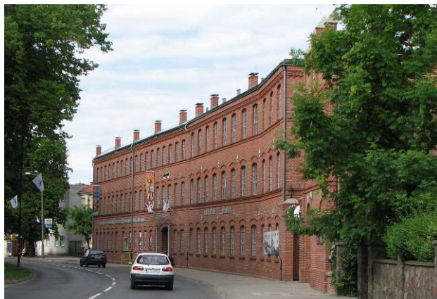
Fig.3. Old factory changed into The Regional Exhibition Centre of Lower Vistula "Arts Factory"

The new and renewed spaces are very popular among the residents but also as a weekend destination among visitors from other parts of the region. For now, however, public interest does not translate into increased interest in business entities. Situation may change as the technical condition of buildings improves.