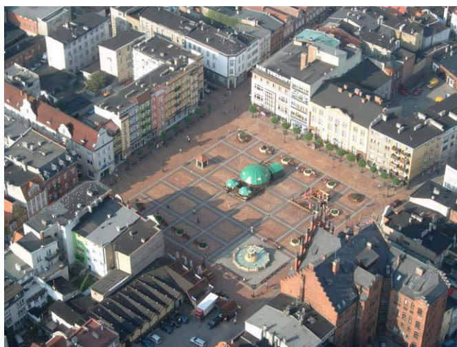
Fig. 10. Bird view of The Old Market Square. Southern frontage on the left.