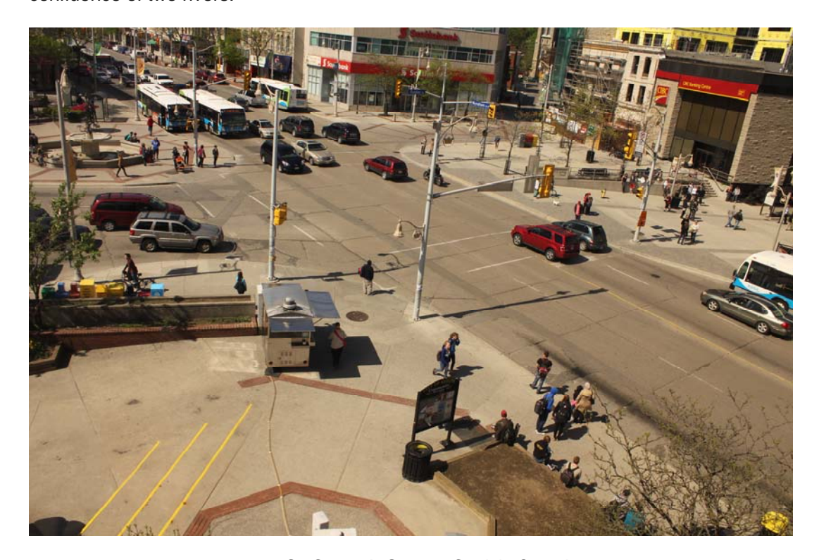
St. George's Square. Guelph, Canada

throughout the commercial area and residential neighbourhoods and it's setting within the confluence of two rivers.