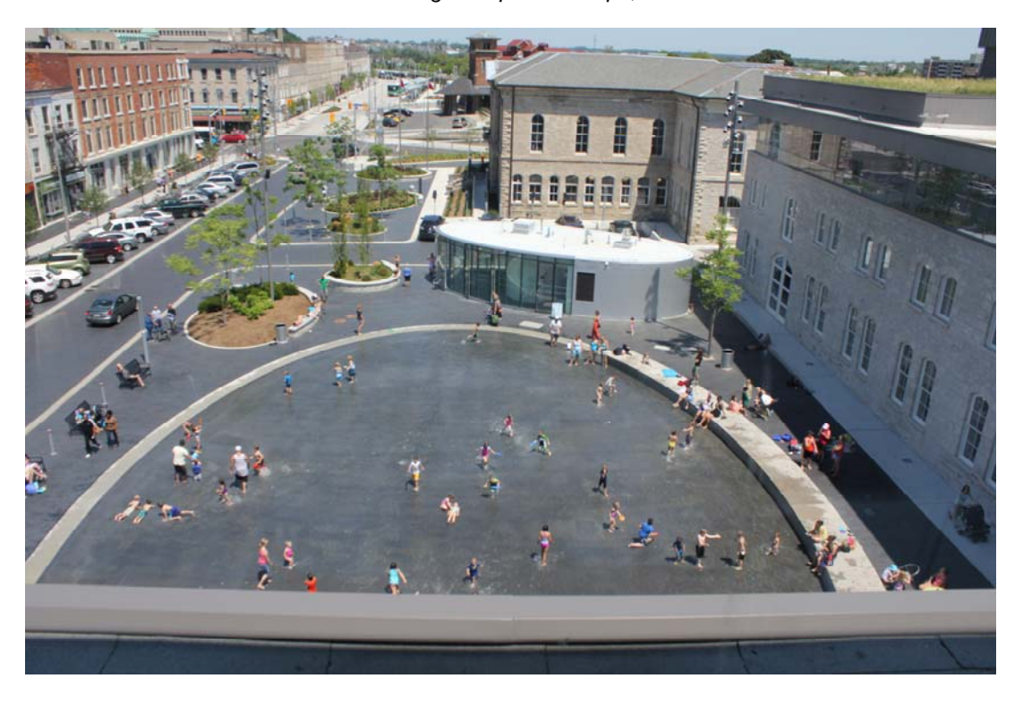
Market Square (Guelph Station in background). Guelph, Canada.