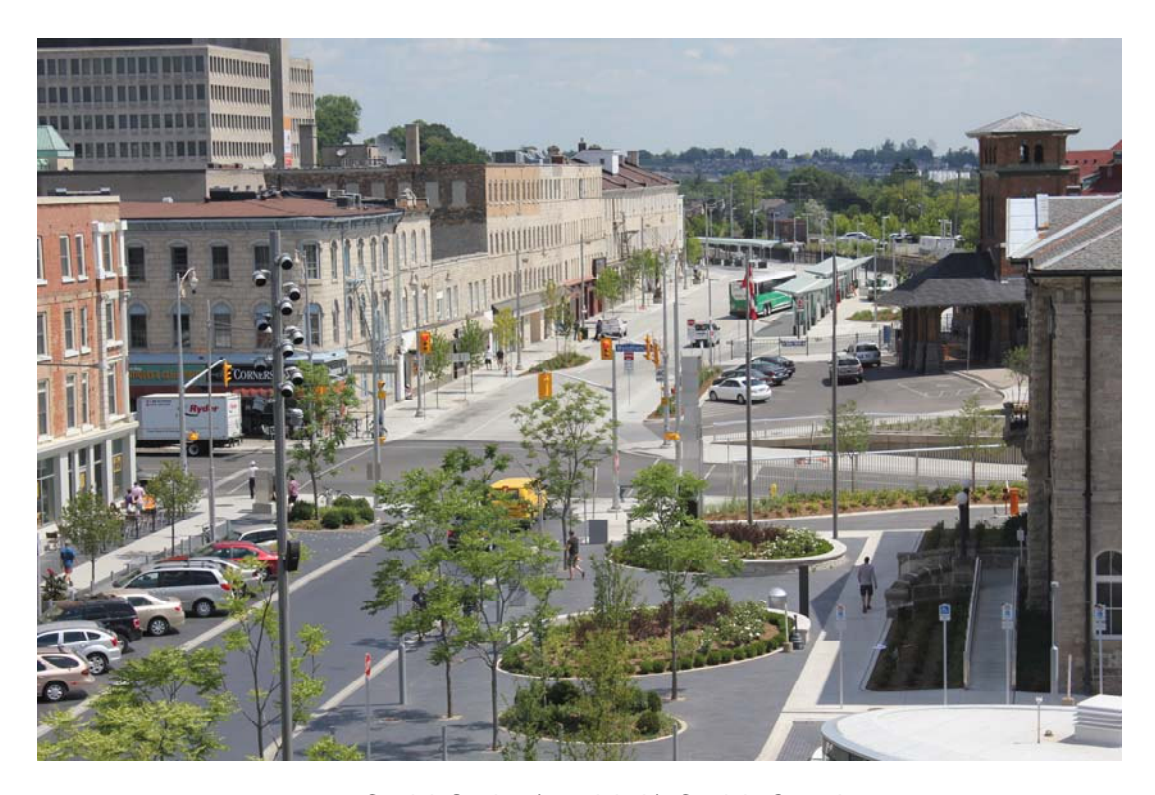
Guelph Station (transit hub). Guelph, Canada

In developing the growth plan for the city with 40% of the growth to be taken up within the downtown core, it became very apparent early on in the process that the provision, design and management of civic space must feature prominently in the reconstituted fabric of City if the community was going to achieve its intensification targets. A common challenge in the evolution of the mid-size city, particularly those that are relatively young and evolving, is the need to increase the value and provision of, exquisitely designed urban civic space to enable citizens to embrace and enjoy more dense urban living. The City of Guelph was fortunate to enjoy two historic civic squares, one recently redesigned, and a third space that had historically served as part of the original civic space infrastructure but that had been recently repurposed as a multi-modal transit hub, the new Guelph Station.