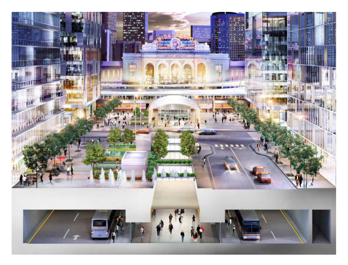
Figure 2: Denver Union Station Redevelopment