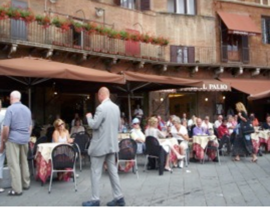
Figures 10 & 11, The Campo in Siena, Site of the annual Palio horse race between Contrade, showing the Palazzo Publicco and the many engaging open air cafes and restaurants which bring together residents tourists and local entertainers and performers.

They both express and generate possibilities of further collaboration, as in the Agora and Stoa of classical Athens, where Socrates stumped around 2.400 years ago, challenging the youth of the city to question the nature of truth and the meaning of citizenship. Further east, one can dine in the open air in Florence's Piazza della Signoria, under the ever-youthful gaze of Michelangelo's David and the safely severed head of Benvenuto Cellini's Medusa. The mix of architecture, art, food and travel still promotes collaboration within and between Tuscan cities, as it does in Brisbane's Post Office Square, depicted below in Figure 13