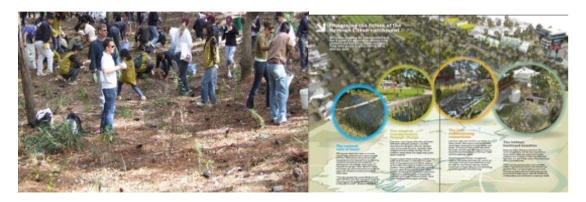
Figures 23 and 24, Working Bee along Norman Creek & Imagining the Future of the Norman Creek Catchment (Brisbane City Council 2012)

Over the last twenty years, this network has grown rapidly from the pioneering work of such local groups as the N4C (Norman Creek Catchment Coordinating Committee). In the 1980s N4C had joined with other Community groups to protect the short but significant Norman Creek valley from massive industrial and road development (Heywood, 2011). As the City Council found it stage by stage forced to adopt the community's alternative recreational and conservation strategies, they moved into a partnership with N4C and with other such groups, now extending to embrace eight creek corridor conservation groups who are consulted, informed and supported by the council.