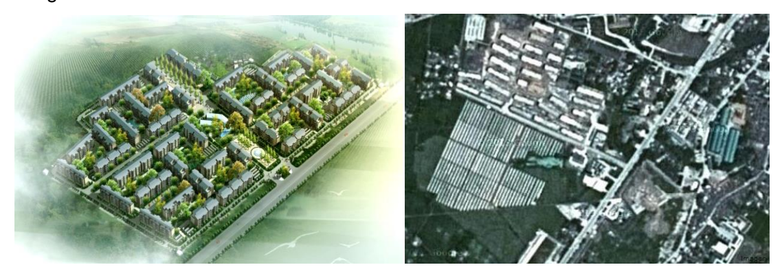
Figure 1: bird-eye view and Google satellite map of Taiping village community

about 8hm², and the number of villager about 3000. All of the villagers have immigrated to the new apartments of six floors, and the personal housing area is about 40m². All of the work force are occupied, 85% of which occupy in the enterprises of secondary and tertiary industry. Besides, all the farm land of villagers is centralized to be running together by an agricultural cooperation founded by the villager themselves. The cooperation hires the 15% of the local work force who are still anticipate the agricultural work, and skilled farm workers from the outside. In order to raise the revenue, the economic crop is cultivated, such as organic vegetable and fruits. As a result, each villager does not need to anticipate the agricultural work, but enjoy the rent of land yearly paid by the cooperation. The personal revenue of villagers is over 7000 rmb in 2011.