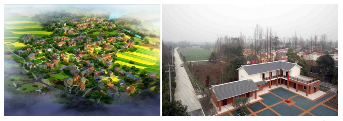
Figure 2: bird-eye view and the building picture of Heming village community<sup>ii</sup>

The second one is Heming Village Community , located in Liujie Town, Dujiangyan County. According to the unique landscape, this village community is not centralized to a single site, but is divided into seventeen clusters. Several buildings of two or three floors with traditional style are built, instead of apartments with modern style. About 86% of the villagers have immigrated to the new buildings. A license of the land property confirmation is certificated to each villager, which assurance the right of villager to use the farm land. As a result, villagers can rent their lands to the cooperation, or do the agricultural work themselves. In fact, almost all the farm land is centralized to the cooperation, which cultivates flowers and develops country tourism.