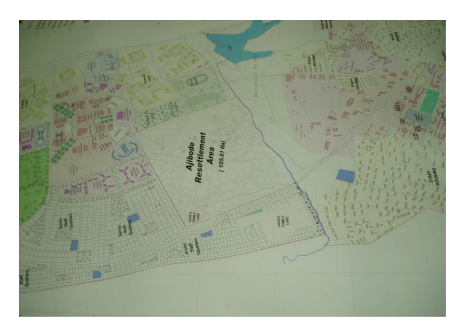
Figure 3: Department of Urban and Regional Planning