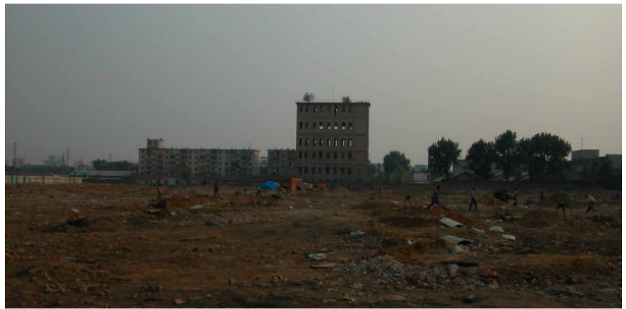
Photograph 3: Regeneration Area