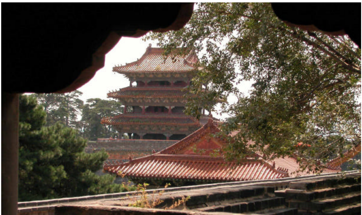
Photograph 2: A Qing Dynasty Tomb

Two aspects of Shenyang's circumstances, antique splendour and the current need for regeneration in some areas, are shown in Photographs 2 and 3.